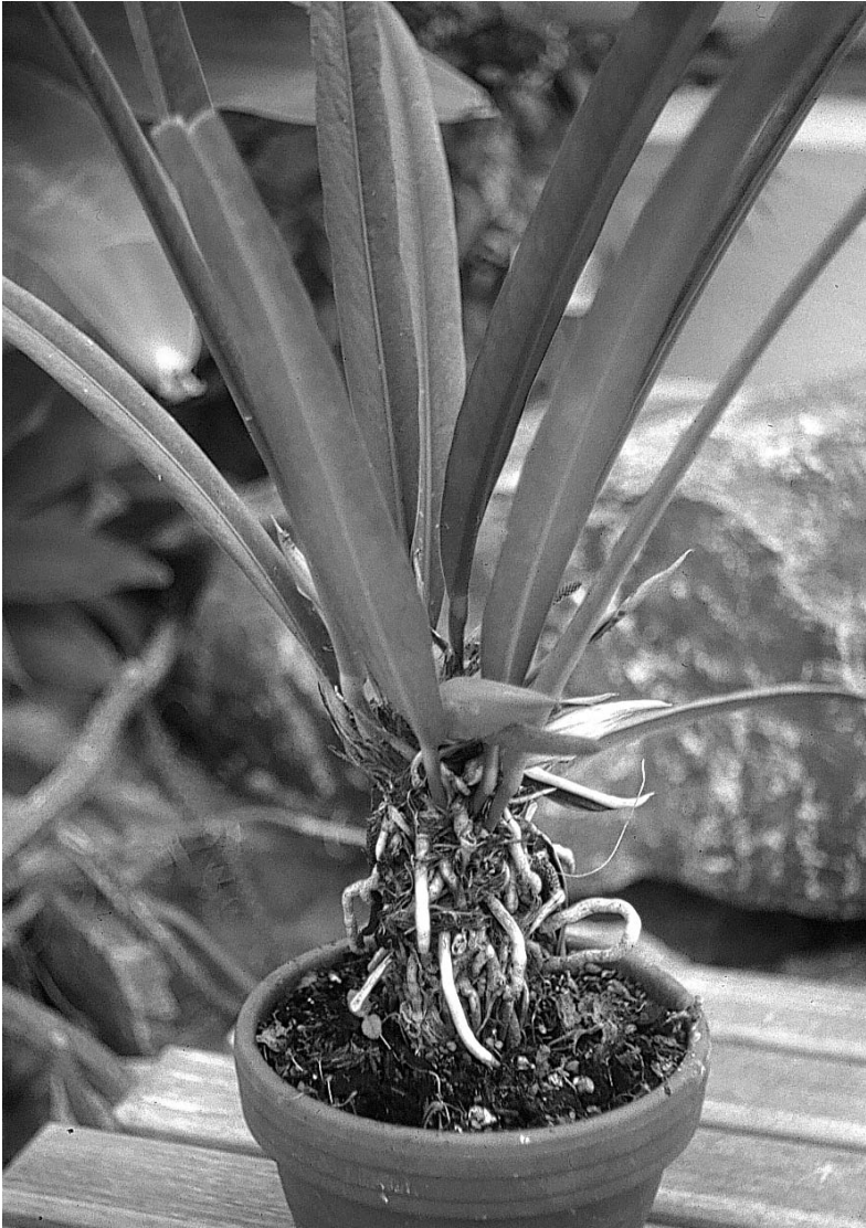
Fig. 1. Anthurium ensifolium – habit of a cultivated individual at the Munich Botanical Garden.

Stem thick, internodes short, 4.5-5.5 cm diam.; roots more or less dense, whitish to greenish, smooth; cataphylls lanceolate, 5-7 cm long, 0.6-0.8 cm wide, persisting as a mass of fibres. Leaves erect to slightly spreading; petiole 3.4-4.5 cm long, 0.3-0.5 cm diam., adaxially shallowly canaliculate with acute margins, abaxially rounded, the surface minutely white-punctate in fresh material, medium to dark glossy green; geniculum slightly thicker than the petiole, clear glossy green, 0.5-1 cm long; sheath 1.4-2 cm long; blade coriaceous, linear-elliptic to linear-oblong, acute to shortly acuminate at apex, obtuse to acute at base, 34-57 cm long, 2-4.5 cm wide, broadest at middle or slightly below, margins very weakly undulate in dry material; surface mat, medium to dark green, sometimes slightly glaucous or velvety, lower face mat, slightly paler, densely white-punctate in living plants; both faces drying mat, yellowish brown;