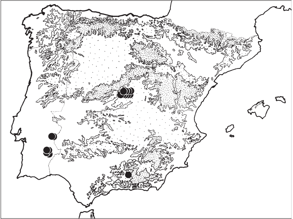
Fig. 3. Known European distribution of Arcyna tournefortii , based on available specimens.

them only in Arctium L., Cynara spp. and Ptilostemon stellatus (L.) Greuter (Greuter, l.c.: 29-30). They appear to be reduced forms of the whip-like hairs that are common throughout the Asteraceae (Solereider, Syst. Anat. Dicotyledons 1. 1908).