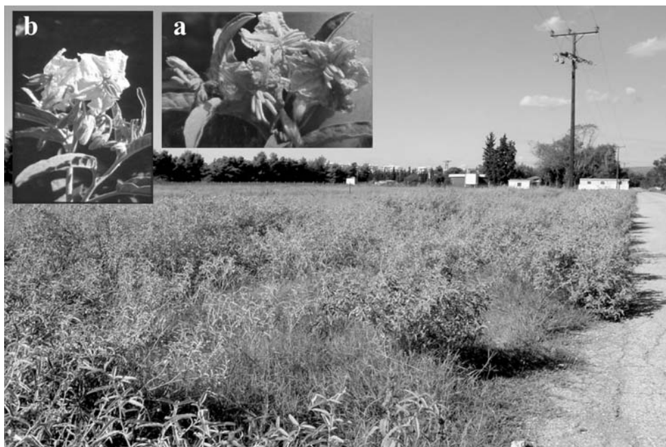
Fig. 2. Fallow fields in the collection site B5i (fringe urban area of the city of Thessaloniki) invaded by Solanum elaeagnifolium , with violet-flowered (a) and white-flowered (b) individuals growing together.

the opinion of Richards (pers. com.). In every other case the relevant source is provided specifically.