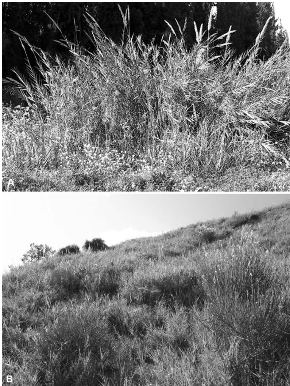
Fig. 2. A: Arundo mediterranea , isolated tufts of “bunch-reed” with obliquely erect peripheral culms at the type locality in Israel. – B: A. collina forming a monospecific grassland, with a few Spartium junceum shrubs, on clay slopes at the catchment area of Biferno river, S Italy.