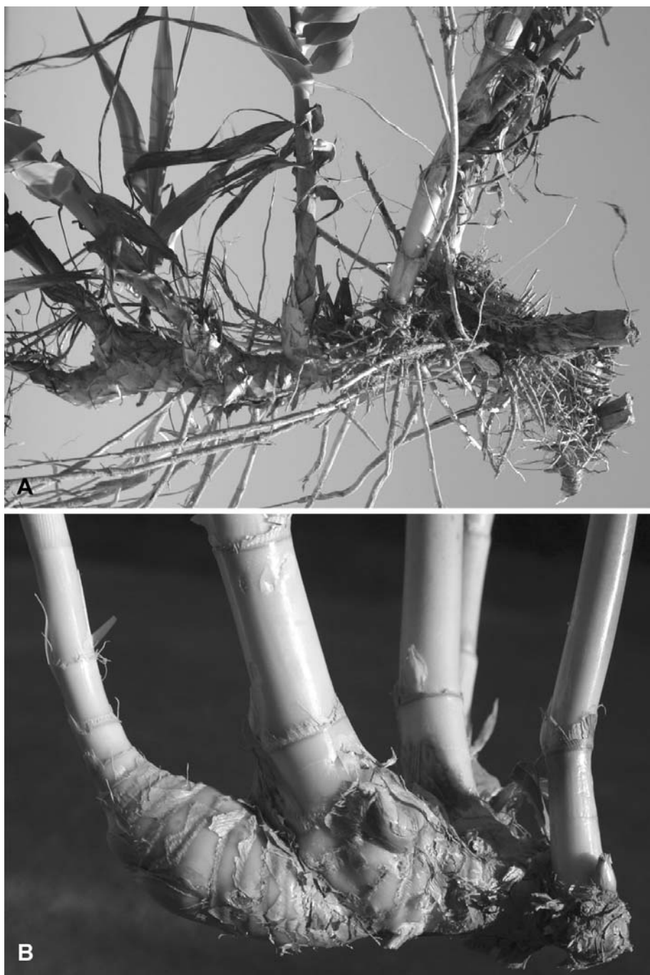
Fig. 3. A: Arundo donax rhizome with spaced orthotropic culms. – B: A. mediterranea , each culm has a 8-10 cm long pachyrhizome section, rich in buds, which may function as a corm; each of the three left culms emerged obliquely from the base of the older culm.