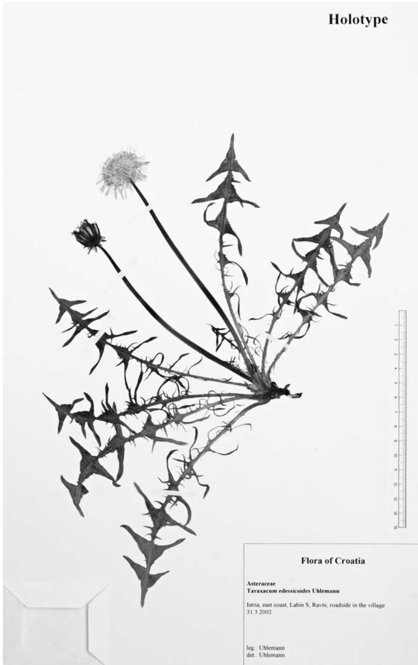
Fig. 2. Taraxacum edessicoides , holotype specimen at B.