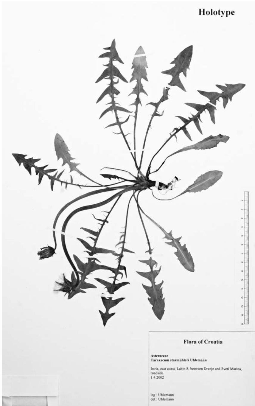
Fig. 1. Taraxacum starmuehleri , holotype specimen at B.