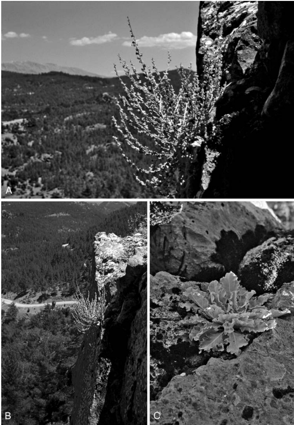
Fig. 2. Verbascum lindae in its natural habitat, Sütçüler, 16 km N of Çandır (Isparta, Turkey) – A, B: habit, flowering; C: sterile rosette.