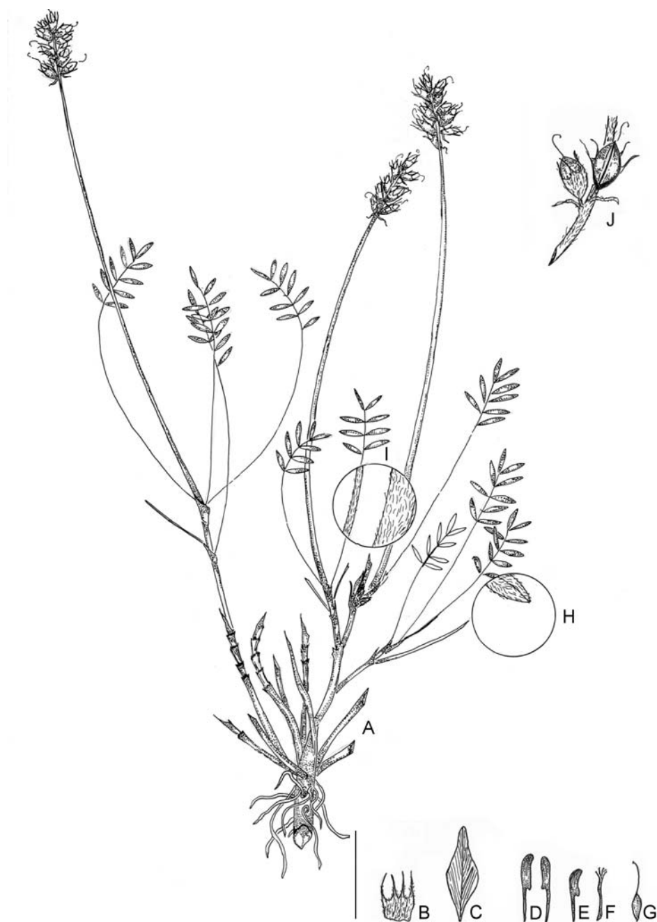
Fig. 2. Astragalus kadschoroides – A: habit (with fruits); B: calyx; C: standard; D: wings; E: keel; F: androgynium; G: gynoeceum; H: indumentum of leaflet; I: indumentum of rachis and peduncle; J: pod. – Scale bar A = 3 cm, B-G, J = 1.5 cm; drawn after the type collection.