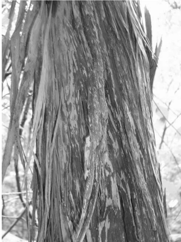
Fig. 2. Trunk of Tetrazygia decorticans , with bark peeling off in laminar shreds.