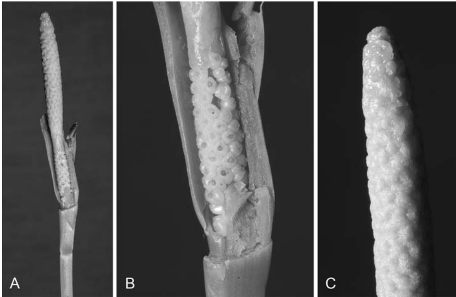
Fig. 4A-C. Chlorospatha feuersteiniae – spadix from a cultivated plant of the type collection; entire spadix (A), pistillate portion (B), staminate portion (C).

Chlorospatha feuersteiniae is the only species from the eastern slopes of the Andes where the lower side of the leaf blade is purple. Some species in this area have purple veins and purple petioles but none is completely purple below. C. feuersteiniae in general appearance looks like Xanthosoma weeksii Madison and X. viviparum Madison with also solitary inflorescences, but the spathes are always constricted and never hooked, and X. viviparum produces additionally conspicuous, small bulbils in the leaf axils.