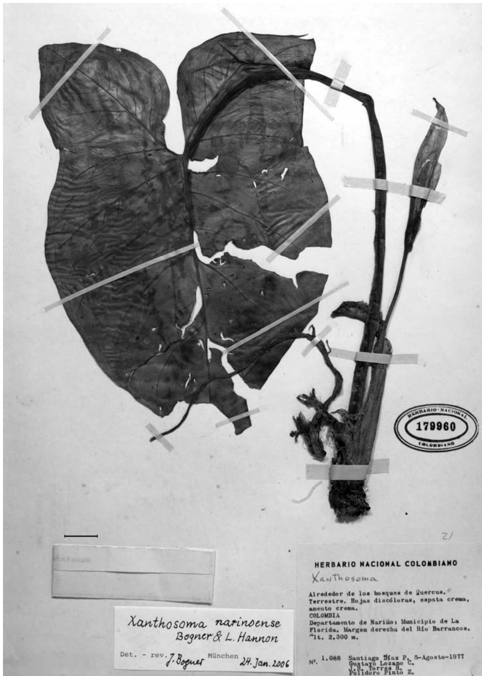
Fig. 1. Xanthosoma narinoense – holotype at COL. – Scale bar = 2 cm; photograph by F. Höck.