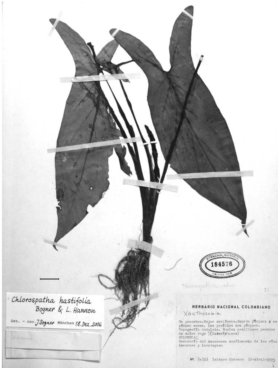
Fig. 3. Chlorospatha hastifolia – holotype at COL. – Scale bar = 2 cm; photograph by F. Höck.