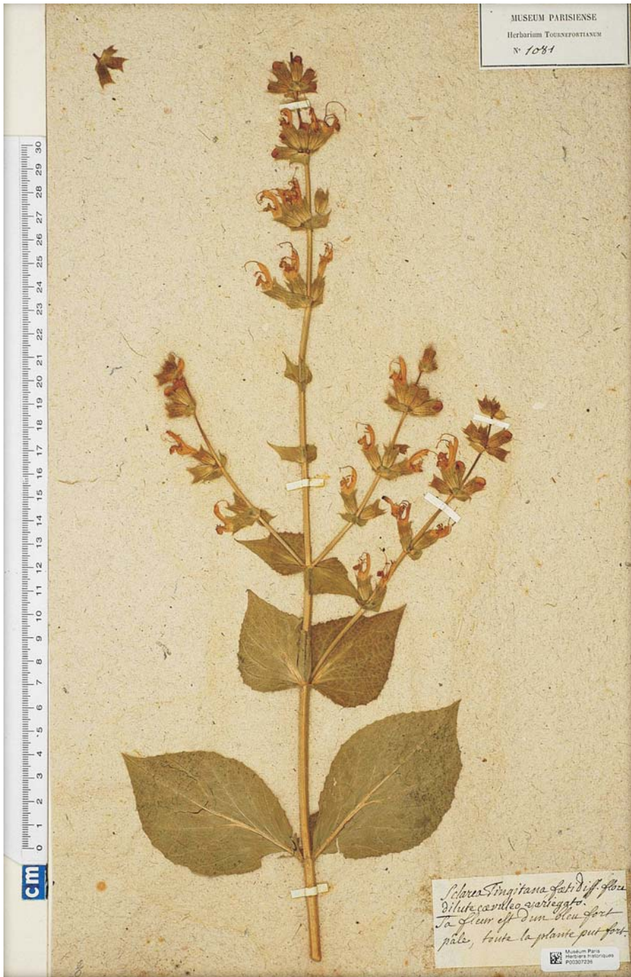
Fig. 3. Tournefort's specimen (at P), the designated lectotype of Salvia tingitana .