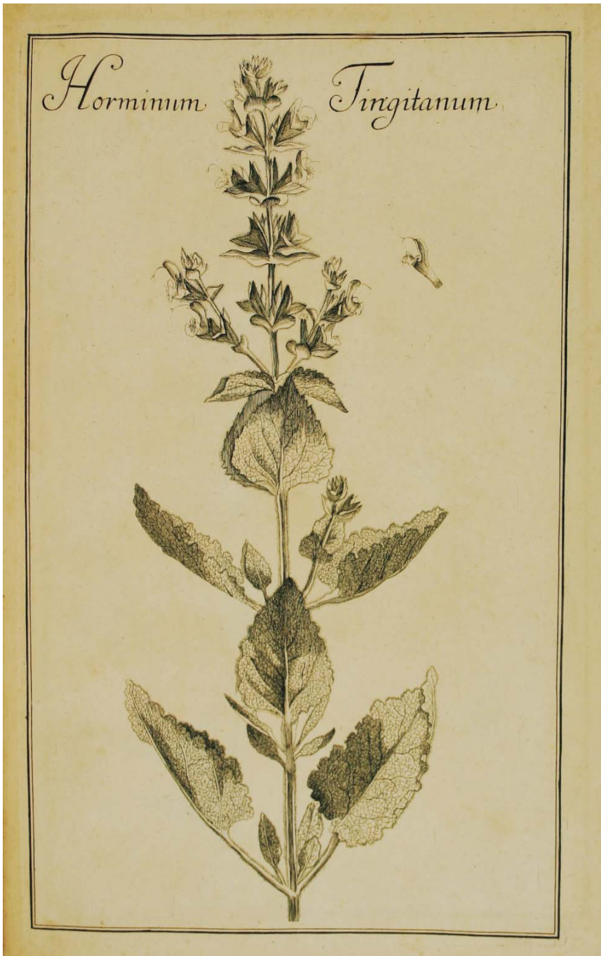
Fig. 2. The exclusive plate of “Horminum tingitanum” (Rivinus 1690: t. 62) in a copy held at the Universitätsbibliothek Erlangen-Nürnberg; to this plate Etlinger (1777) referred in the original description of Salvia tingitana .