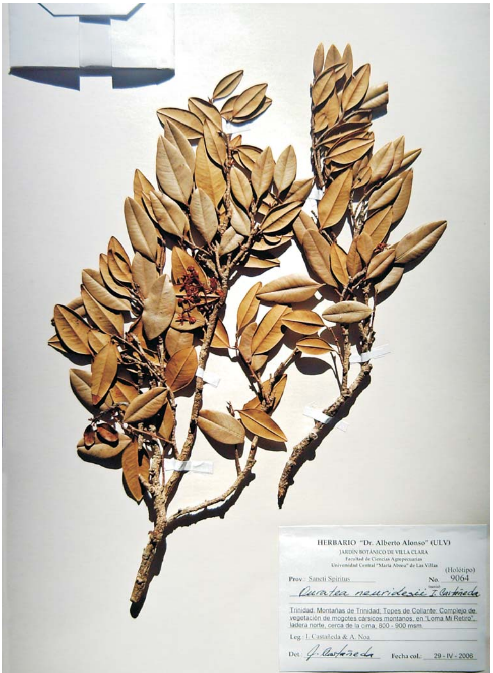
Fig. 1. Ouratea neuridesii – photograph of the holotype specimen.