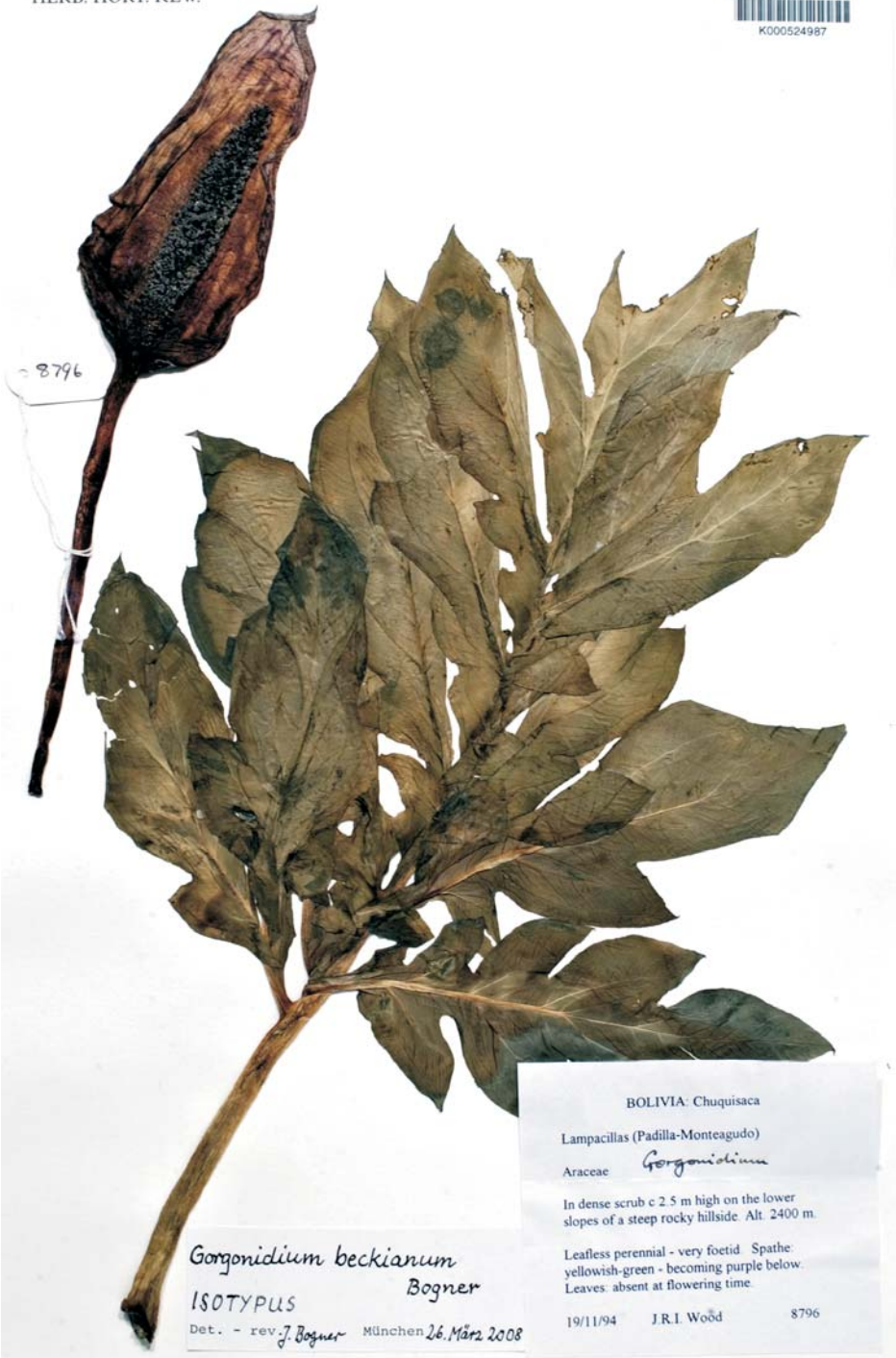
Fig. 2. Gorgonidium beckianum – isotype J. R. I. Wood 8796 at K.