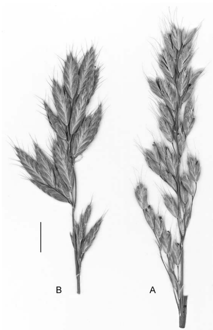
Fig. 1. A: Bromus parvispiculatus (from the holotype, Willing 87413). – B: B. hordeaceus subsp. mediterraneus (France, Var, 1860, F. Schultz, herbarium normale, nov. Ser. Cent. 13, No. 1272 as B. molliformis ). – Scale bar = 1 cm.

of glumes and lemmas on drying, a relative high lemma awn insertion of 0.5–1.7 mm below the obtuse or short-bilobed lemma apex as well as the more or less spreading, softly and densely long-hairy indumentum at least on the lower leaf sheaths (except for B. hordeaceus subsp. longipedicellatus , a probably hybrid derivative; Spalton 2001). The interrelationships of all these taxa are obscure. Some similarities in the loose panicle configuration of B. hordeaceus subsp. pseudothominei (6.5–8 mm long lemmas; the mostly non-weedy subsp. thominei , similar in lemma size, differs, e.g., by its compact inflorescences!) and B. parvispiculatus may one lead to the assumption that the latter is the Mediterranean vicariant of the more northerly distributed subsp. pseudothominei and should therefore better be treated as a subspecies of B. hordeaceus .