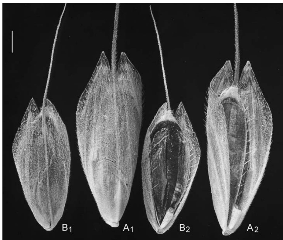
Fig. 2. Florets in fruiting state (1 = dorsal and 2 = ventral view) – A: Bromus incisus (from Otto 10651); B: B. lepidus (from Otto 10461). – Scale bar = 1 mm; photograph by Otto.

The Herbarium of the Botanical Museum Berlin-Dahlem (B) holds a mounted specimen of an annual brome grass obtained in 1946 from R. Gross, who himself received it from the National Her-