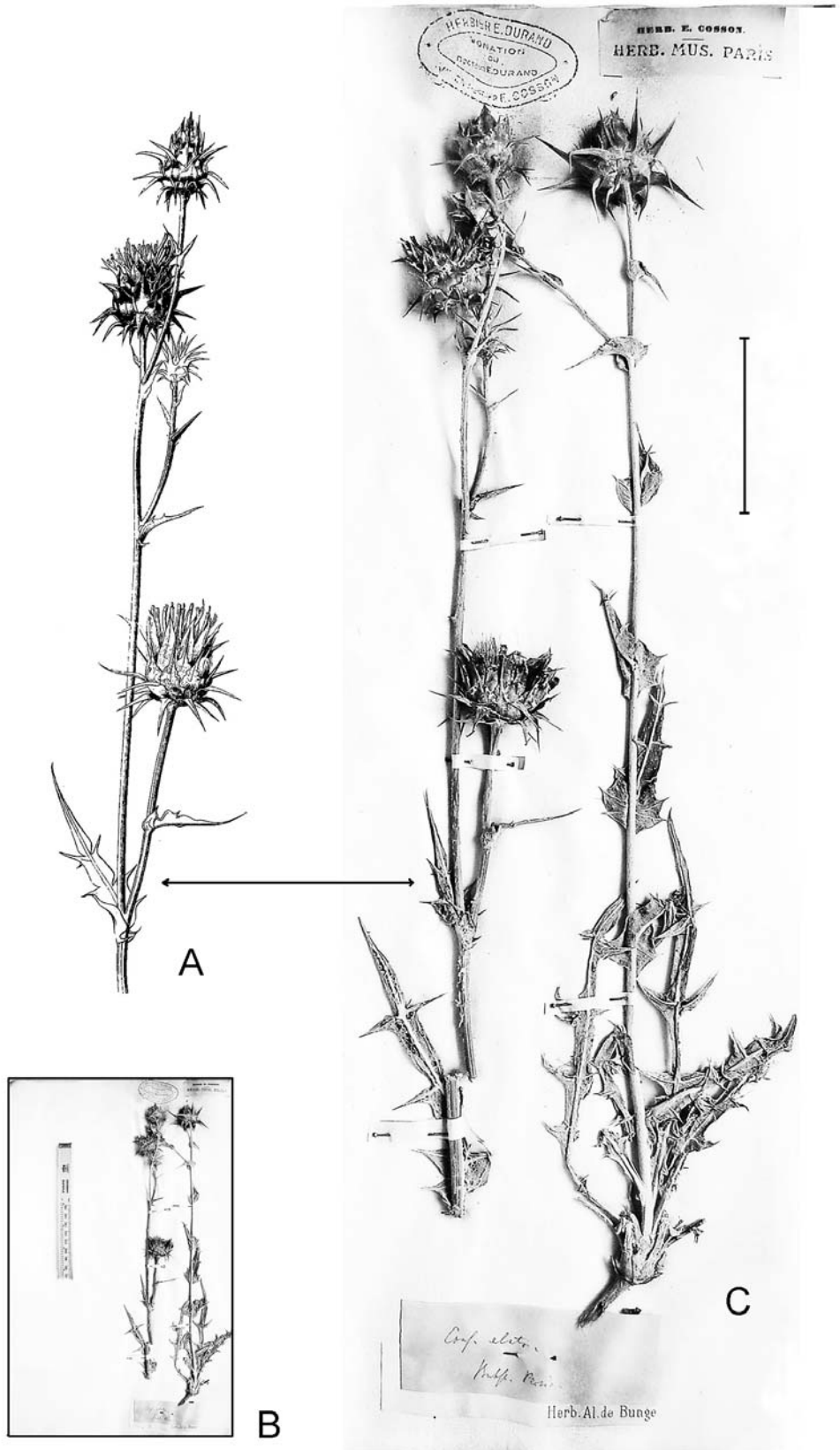
Fig. 1. Comparison of the illustration of Cousinia elata by Buhse (1899) with herbarium material – A: part of original illustration by Buhse (1899); B-C: herbarium sheet (Buhse 1046/5, P) with two specimens. – Scale bar: 5 cm.