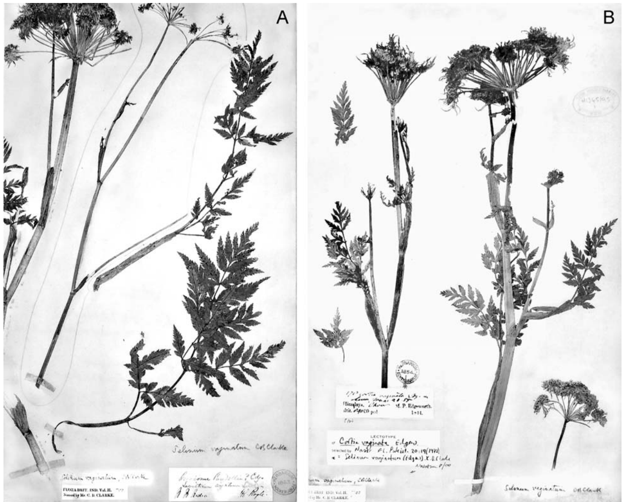
Fig. 1. Type specimens – A: Levisticum argutum Lindl. (K); B: Cortia vaginata Edgew. (K).

The name Selinum vaginatum , widely accepted at present, is based on Cortia vaginata Edgew. (Edgeworth 1845). However, Levisticum argutum Lindl. (Lindley 1835) refers to the same species, as a comparison of their type specimens, both kept in Kew (Fig. 1), revealed. Levisticum is a genus completely absent from the Himalayan flora. The description of L. argutum is rather short, and it is not surprising that the name was almost completely forgotten. Edgeworth (1845) and Clarke (1879) suggested (the latter with some hesitation) L. argutum was conspecific with Cortia elata Edgew. ( \equiv Ligusticum elatum (Edgew.) C. B. Clarke). Mukherjee & Constance (1993), however, did not confirm this synonymy.