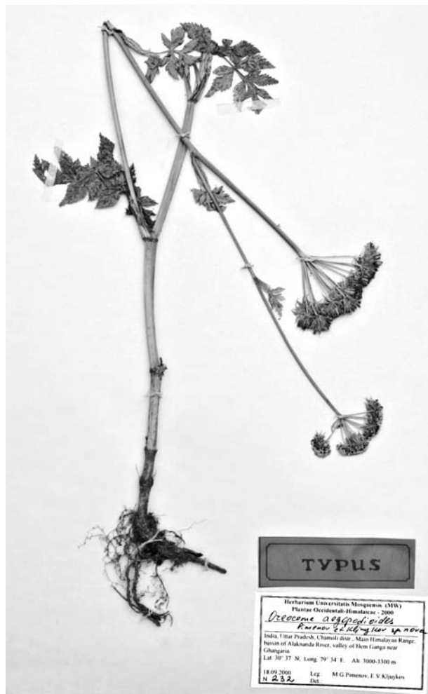
Fig. 3. Oreocome aegopodioides Pimenov & Kljuykov, holotype at MW.

Oreocome nuristanica Pimenov & Kljuykov, sp. nov. Holotype: Afghanistan, "Nuristan, Minjan, Ptili, 2700 m", Edelberg 2130 (W!; isotype: C)