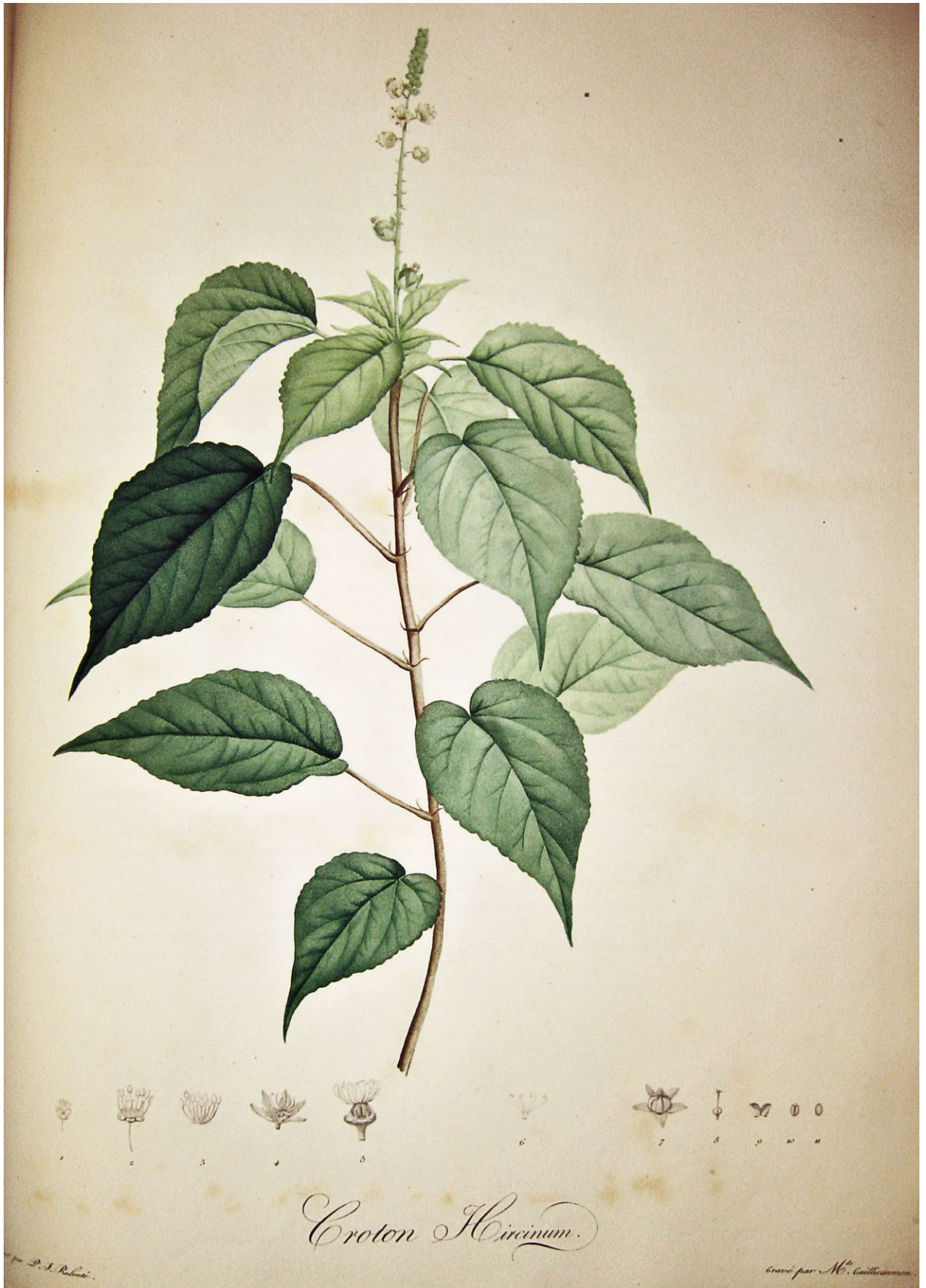
Fig. 1. Illustration of Croton hircinus in Ventenat (1803: t. 50), the designated lectotype of C. hircinus . – Reproduced with permission from the Library of the Gray Herbarium, Harvard University, Cambridge, Massachusetts, U.S.A. Downloaded From: https://complete.bioone.org/journals/Willdenowia on 17 Feb 2025 Terms of Use: https://complete.bioone.org/terms-of-use