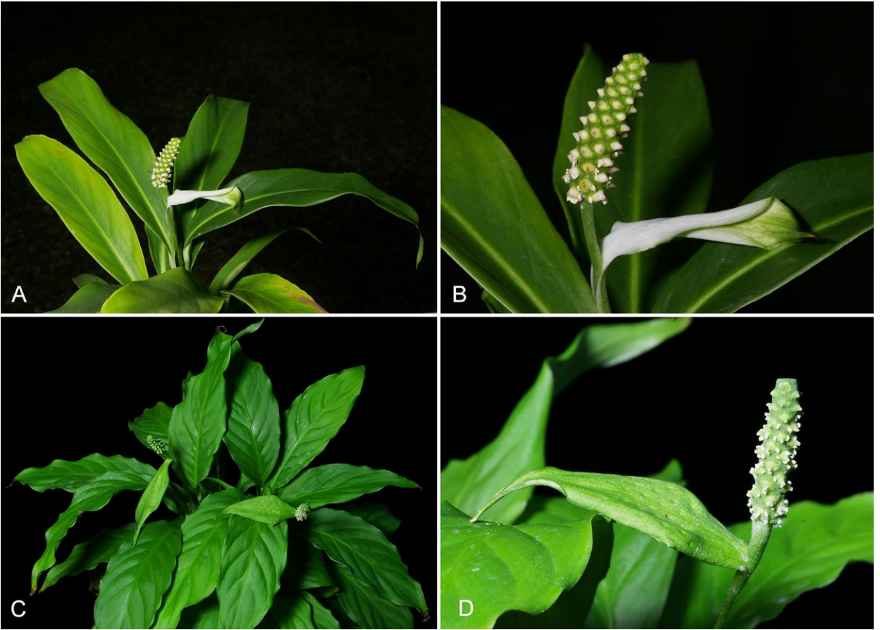
Fig. 1A–B. Spathiphyllum pygmaeum – whole plant (A); inflorescence (B), note the white spathe with a green apex and recurved margins. – C–D: S. minor – whole plant (C); inflorescence (D), note the completely green spathe. – A–B from the plant cultivated in the Botanical Garden Munich of which the holotype was preserved, C–D from Bogner 2978, Botanical Garden Munich. – All photographs by Günter Gerlach.

slightly thinner, third order veins very thin and inconspicuous. Inflorescence shorter than the leaves; peduncle c. 8 cm long and c. 1.8 mm in diam., terete, green, mostly enclosed by the sheath of the preceding leaf and projecting for only c. 1 cm beyond; spathe narrowly elliptic, c. 3 cm long and 0.9 cm wide, pure white on both sides but midvein light green, base decurrent, apex c. 0.8 cm long, green, margin of spathe recurved; stipe of spadix c. 1 cm long and 1.2 mm in diam., green; spadix subcylindric to slightly conoid (narrowing towards apex), c. 2 cm long and to c. 0.5 cm in diam. Flowers bisexual, c. 1.8 mm in diam.; tepals 6, truncate, c. 1.5 mm long, upper part green and 0.8 mm wide, lower part white; gynoeceium c. 2 mm long, ovary obovoid, 1.4–1.5 mm long, in upper part 1.3–1.4 mm in diam., at base c. 0.9 mm in diam., 2-locular; ovules anatropous, 1 ovule in each locule, c. 0.5 mm long; style conoid, white, c. 0.5 mm long, exserted from the tepals, stigma small, disk-like, c. 0.4 mm in diam., whitish when fresh, becoming brownish; tissue of gynoeceium with many trichoslereids; stamens 6, filament flat, 1–1.1 mm long 0.7–0.8 mm wide, shorter than the tepals during the female stage, elongated to about 1.5 mm length at maturity (in the male stage),