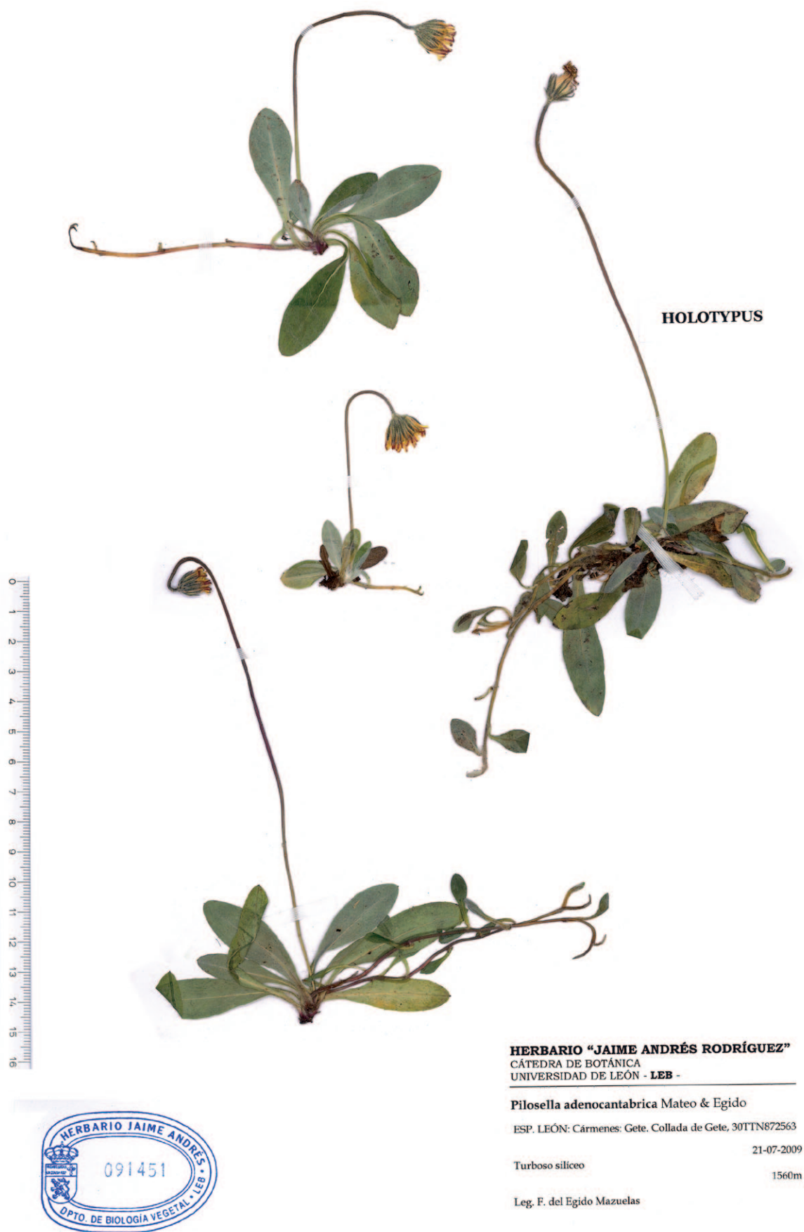
Fig 3. Pilosella adenocantabrica – holotype at LEB.