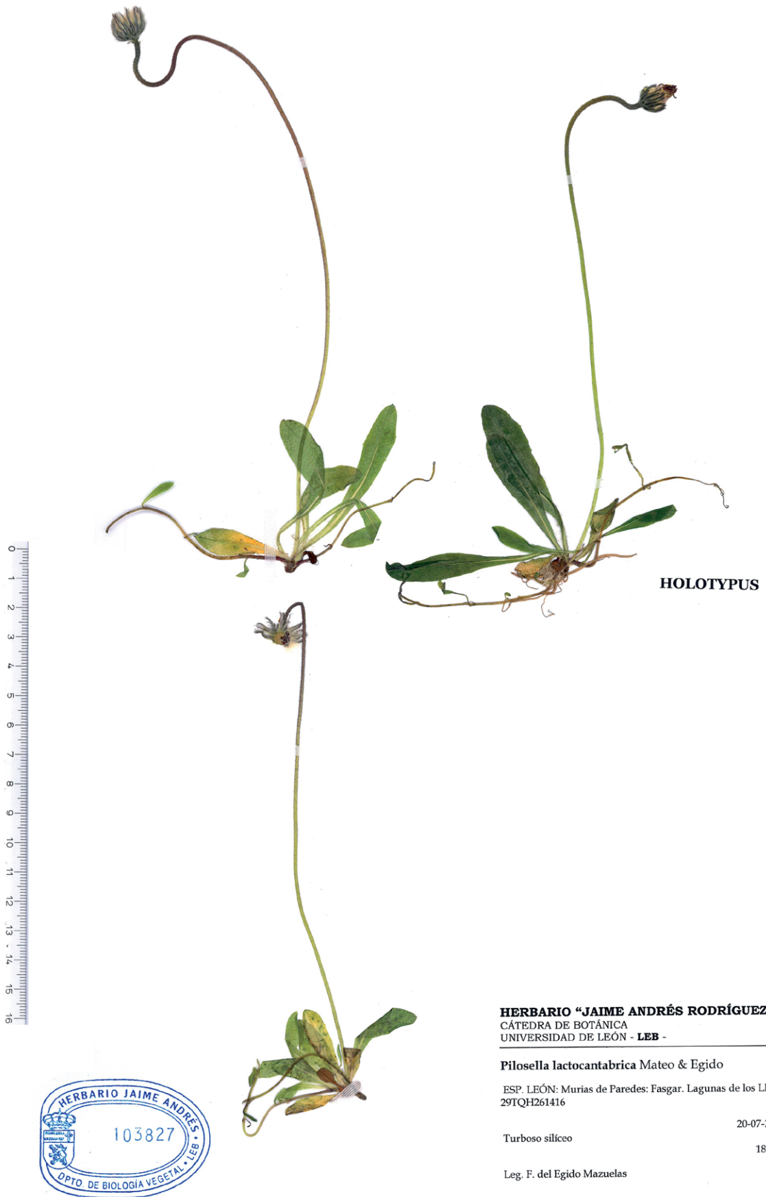
Fig. 1. Pilosella lactocantabrica – holotype at LEB.