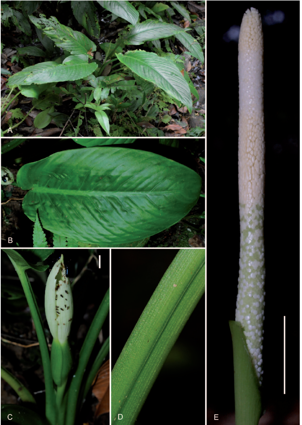
Fig. 2. Schismatoglottis ranchanensis – A: plants in habitat; B: leaf blade; note the conspicuously raised primary venation; C: inflorescence at pistillate anthesis, the inflated spathe limb coincides with the upper part of pistillate flower zone; D: petiole showing the longitudinal ridges and D-shaped cross section; E: inflorescence with spathe artificially removed to reveal the long interstice, c. \frac{1}{4} of the spadix length, and the button-like interstillar staminodes. – Photographs from the type collection; scale bars: C + E = 1 cm.