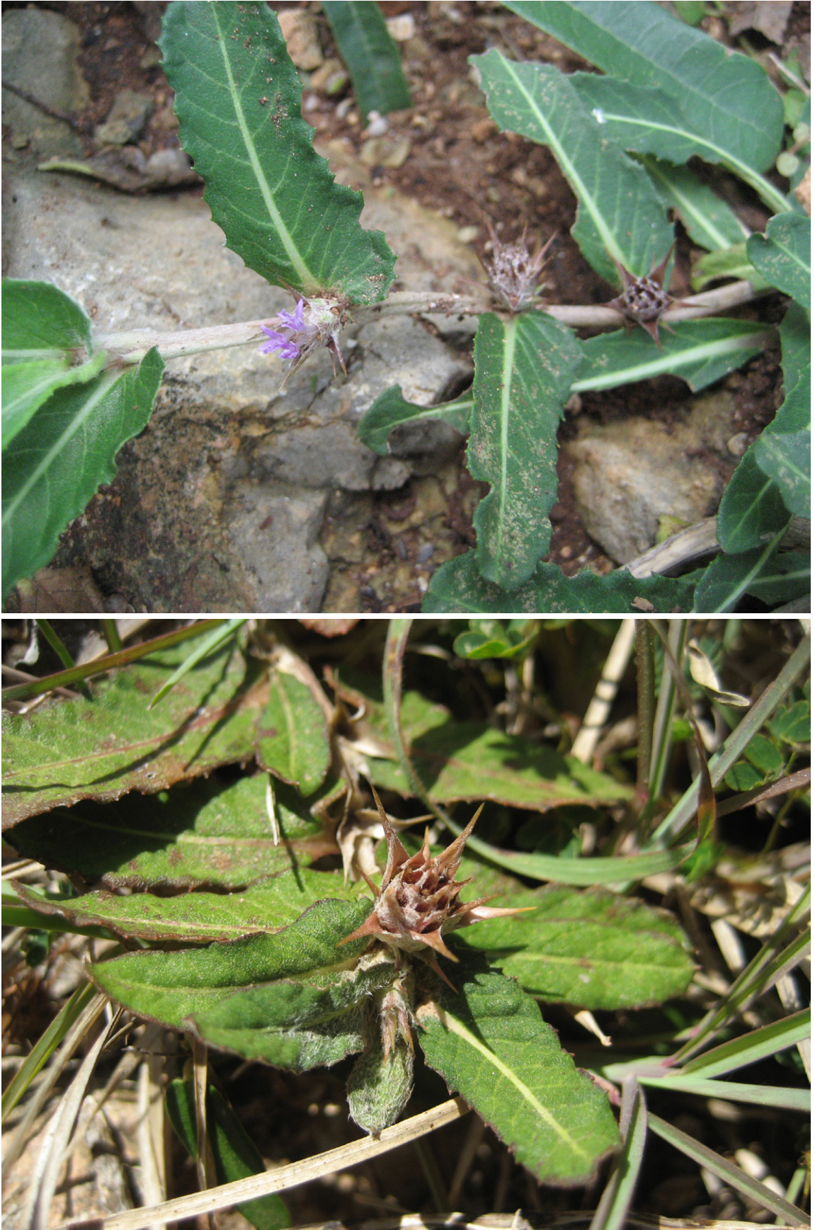
Fig. 1. Acanthodesmos gibarensis at the type locality – A: flowering shoot, November 2011; B: shoot with with mature capitulum, April 2013.