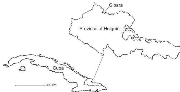
Fig. 3. Geographic distribution of Acanthodesmos gibarensis .