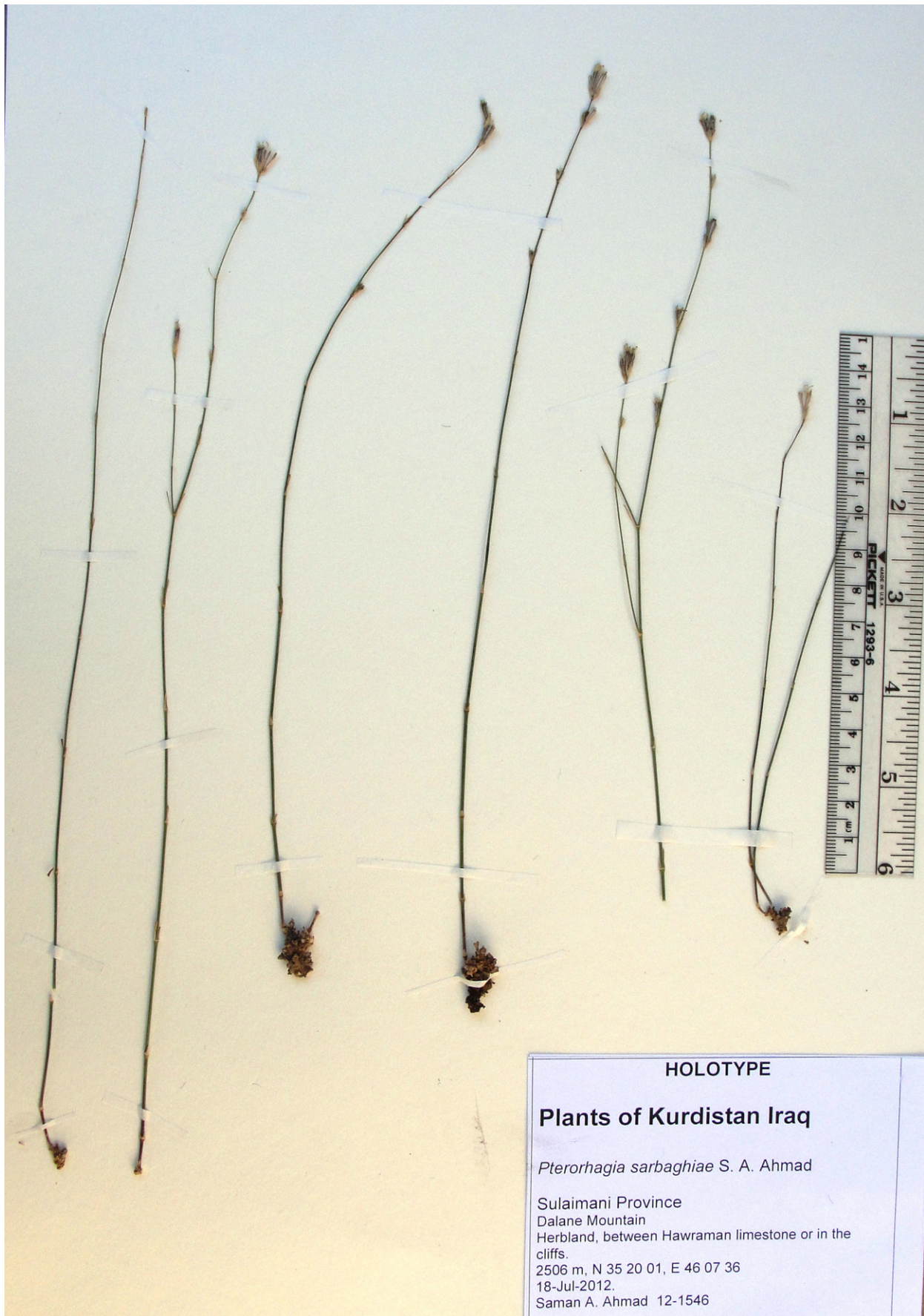
Fig. 1. Petrorhagia sarbaghia – photograph of the holotype specimen at SUFA.