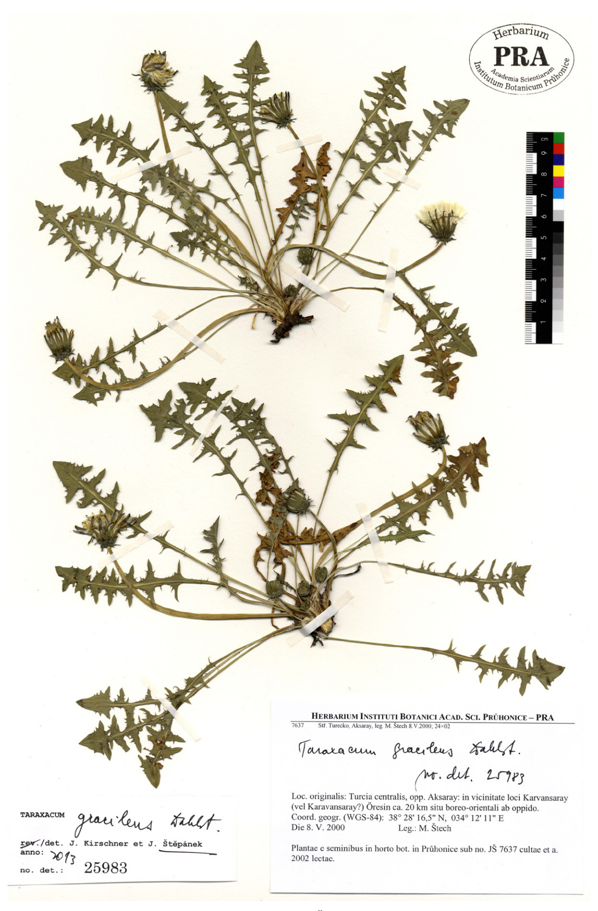
Fig. 2. Taraxacum gracilens Dahlst. - Specimen from C Turkey (M. Štech s.n., PRA - no. det. 25983).