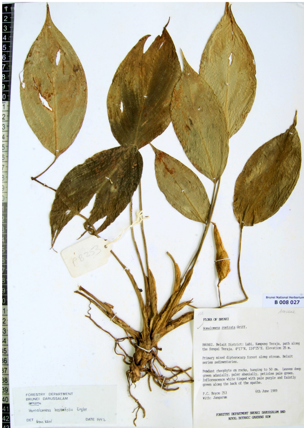
Fig. 3. Homalomena scutata – holotype specimen: P. C. Boyce 253 (BRUN – B 008 027).