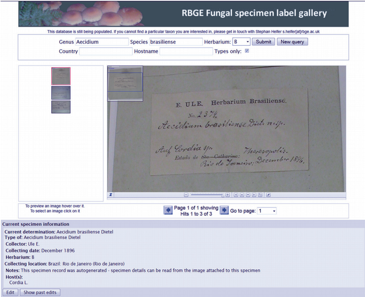
Fig. 1. Screen shot from the web resource for the rust herbarium specimen database based at the Royal Botanic Garden Edinburgh.

tinued, and a new initiative of online information about the availability of type specimens is necessary, including for the fungi. The project described in this paper aims to contribute to such an initiative for type specimens of rust fungi ( Uredinales or Pucciniales ). The main advantage of the approach taken here, compared with initiatives involving dedicated digitization stations, is the speed at which whole herbaria can be imaged.