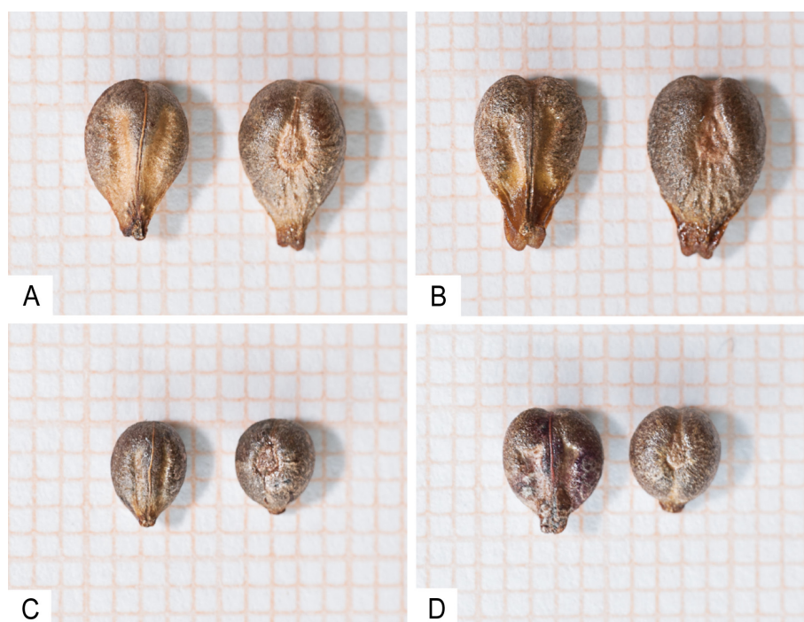
Fig. 3. Vitis \times novae-angliae , V. labrusca , V. riparia and V. koberi seeds, ventral (on left) and dorsal (on right) sides, on 1 mm squared paper – A: V. novae-angliae (Albuzzano, Italy); B: V. labrusca (Pavia, Italy); C: V. riparia (Portalbera, Italy); D: V. koberi (Montù Beccaria, Italy). – Photographs by C. Ballerini.

according to their terminology) hybrids that originated in natural habitats of E North America (states of New York and Tennessee, respectively, see Hedrick 1908), then discovered and transferred into cultivation during the first half of the 19 th century (to serve also as a basis for the selection of the other cultivars). However, artificial crossing between V. labrusca and V. riparia is likely to have occurred in European nurseries, as stated by Viala & Ravaz (1892), who excluded a direct employment of American “hybrides sauvages” in France, being of little viticultural interest.