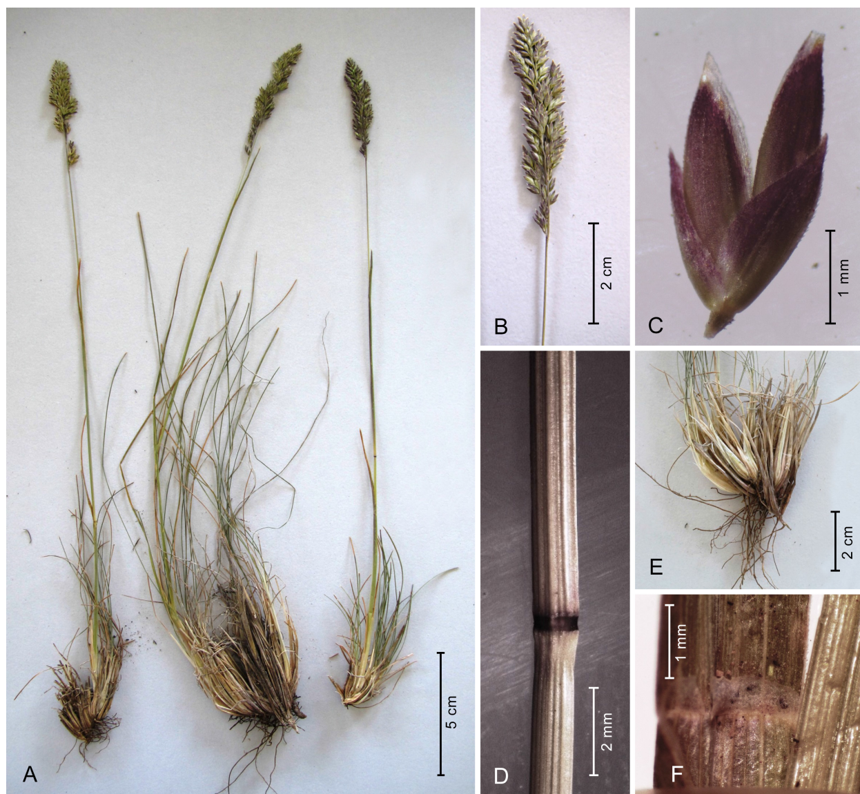
Fig. 2. Poa densa (E. Cabi 5135) – A: habit; B: inflorescence; C: spikelet; D: culm upper node; E: basal bulbous shoots; F: ligule.

1816, nec Blytt 1861]. – Lectotype (designated here): Georgia, Tbilisi region, Gargjiiskaya steppe, 17 Jun 1927, N. Troitsky (LE [photo at E!: E00326518]).