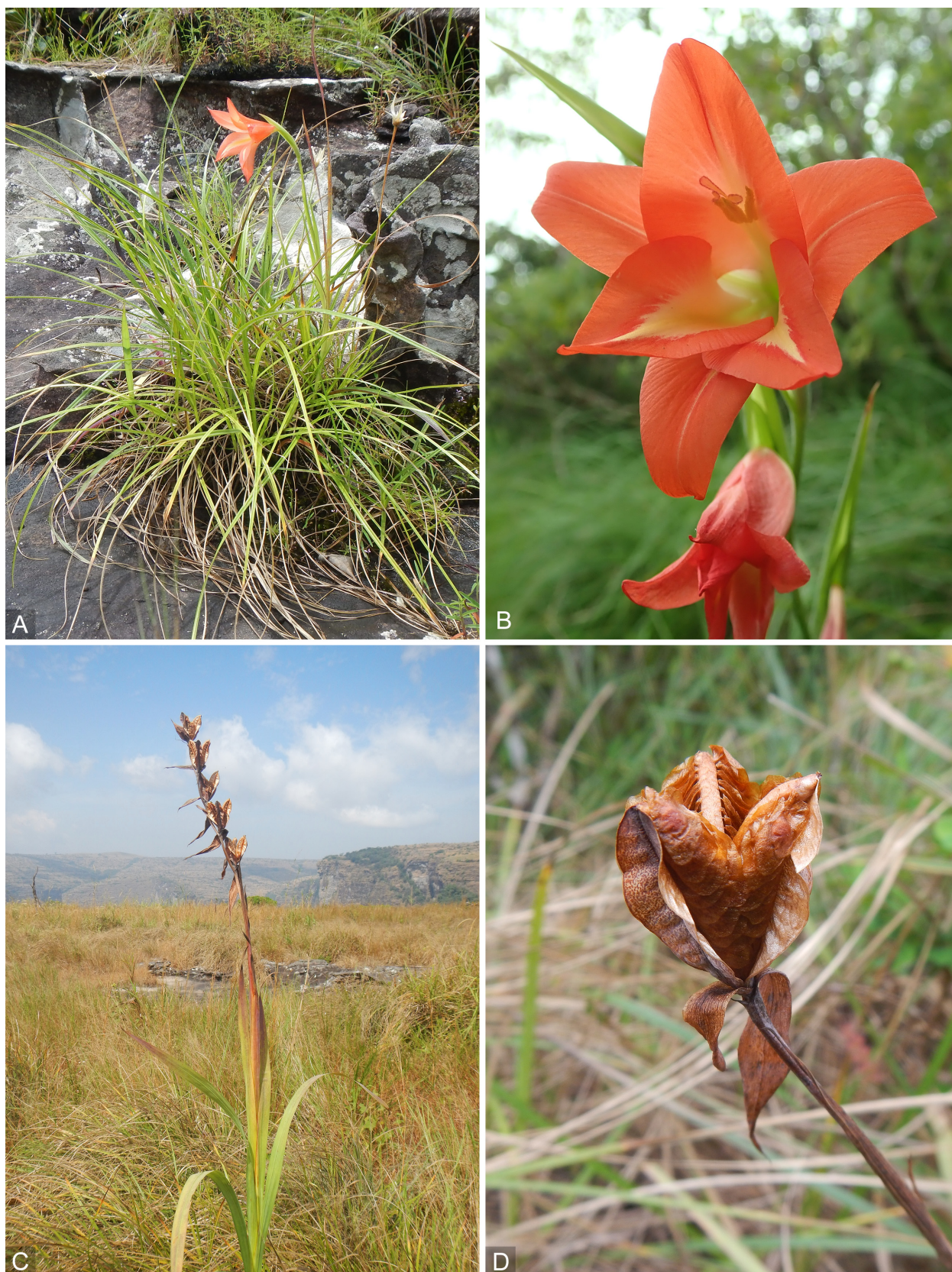
Fig. 1. Gladiolus mariae – A: habit of flowering plant; B: flowers; C: fruiting plant; D: fruit. – Origin: A from Burgt & Haba 2012 (type gathering); B from Burgt 2207 ; C, D from Burgt 2161 . – All photographs by Xander van der Burgt.