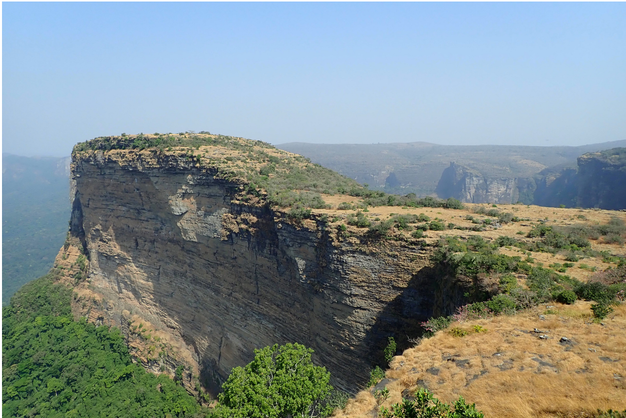
Fig. 6. Submontane wooded grassland vegetation in the Kounounkan Massif. Gladiolus mariae was collected on this 1020 m high hill and was also observed there, growing on vertical sandstone cliffs. In some years the vegetation on the hill is not subject to the annual dry season fires because it is separated from the main plateau by a narrow, 350 m long canyon.

In Afromontane shrubland, fire has often favoured the spread of grasses at the expense of the shrubs (White 1983: 49). Anthropogenic fires are usually ignited in the dry season when lightning-ignited fires would not normally occur (Archibald & al. 2012) and have a large influence on species composition and structure of the vegetation (Bond & al. 2005; Staver & al. 2011).