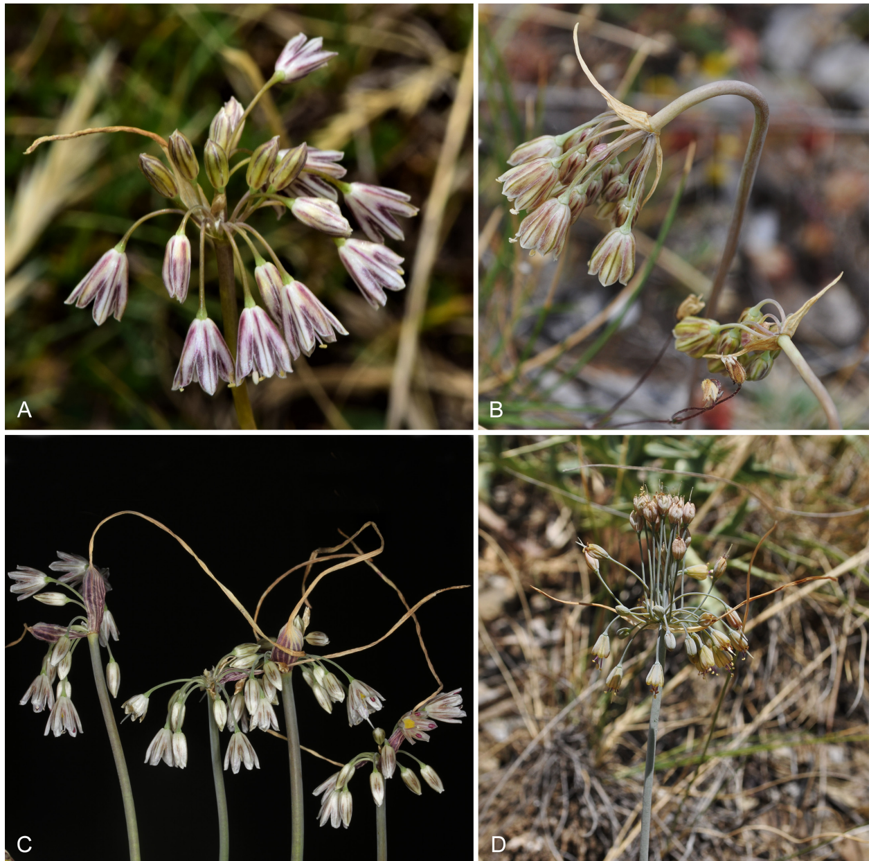
Fig. 1. Inflorescences – A: Allium oreohellenicum from S Pindos (Mt Kakarditsa, 6 Aug 2017, photograph by I. Kofinas); B: A. frigidum from Peloponnisos (Mt Panachaikon, 24 Jul 2014, photograph by D. Tzanoudakis); C: A. parnassicum from Sterea Ellas (Mt Parnassos, 28 Jul 2015, photograph by P. Trigas); D: A. flavum subsp. tauricum from Peloponnisos (Mt Klokos, 11 Jul 2017, photograph by D. Tzanoudakis). – The last (D) erroneously considered by Bogdanović & al (2011) as the “true A. achainum ”.

Stearn (1978, 1980, 1981) and Kollmann (1984: 135). On the contrary, A. achainum has been subsequently reappraised as a distinct species of the Greek flora by Andersson (1991: 709), with the Orphanides gathering from Mt Klokos in G-BOISS as the holotype of the species and its total distribution range indicated from Peloponnisos to the mountains of Sterea Ellas and Southern and Northern Pindos (Thessalia/Ipiros).