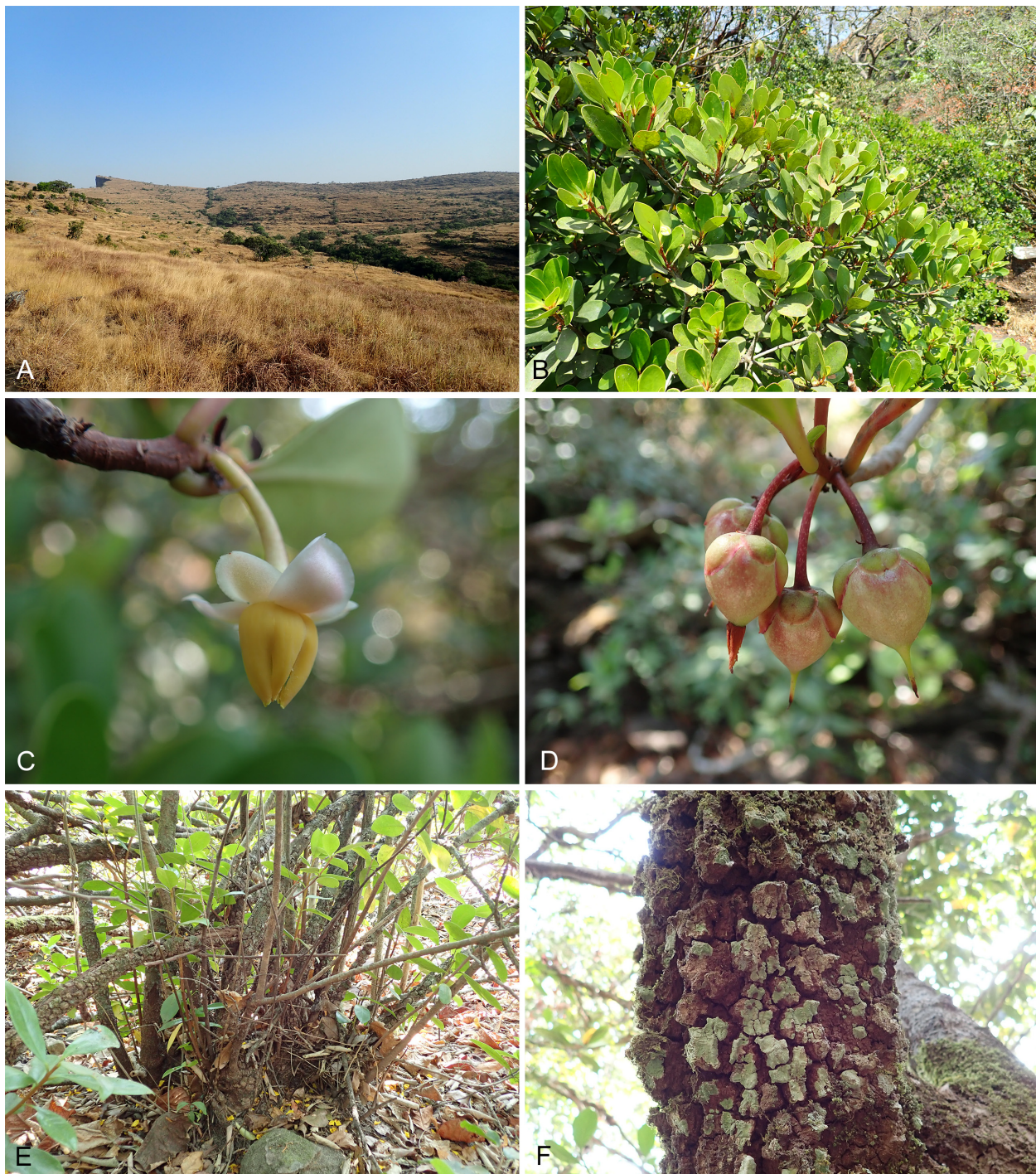
Fig. 2. Ternstroemia guineensis – A: habitat, submontane gallery forest in sparsely wooded grassland; B: habit; C: flower; D: fruits; E: base of a multi-stemmed shrub; F: bark of a tree, trunk c. 18 cm in diam. – Photos: Republic of Guinea, Kounounkan Massif, Feb 2019, Xander van der Burgt.

concave, thick, leathery, outer surface wrinkled when dry, unequal, outer pair suborbicular, c. 4.5 \times 5.2 mm, leathery, margin scarious, 0.5–1 mm wide, erose, apex rounded or retuse, sometimes with mucro 0.3–0.4 mm long, inserted adaxially below margin; inner sepals ovate, c. 6.5 \times 6 mm, mucro absent, margin as outer sepals. Petals 5(or 6), yellow or yellowish white, together forming a short cylinder enclosing stamens, petals imbricate, connate in basal \frac{1}{4} (for 1.7–2 mm, Fig. 1F, 2C), each nar-