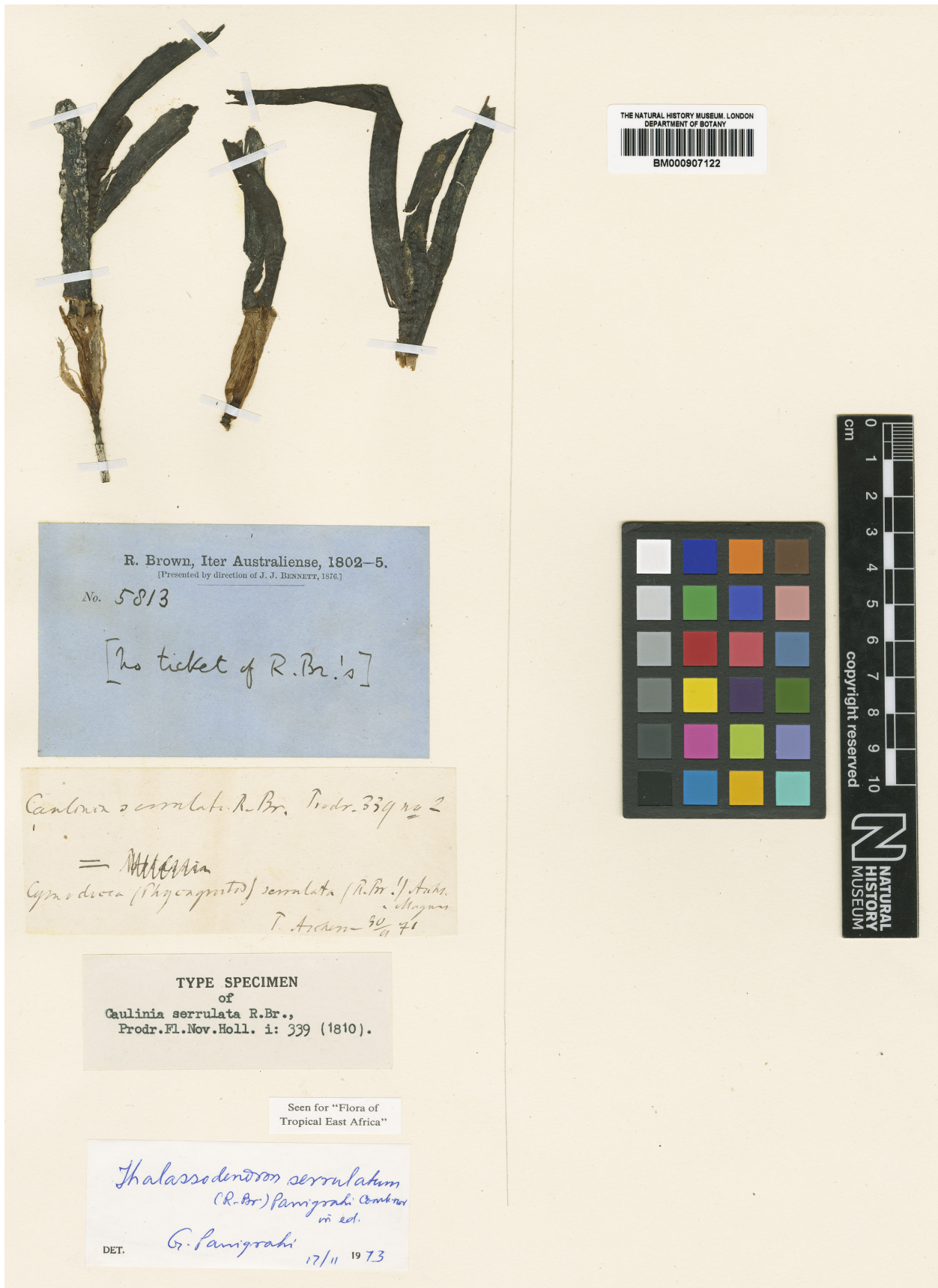
Fig. 3. Lectotype of Caulinia serrulata ( \equiv Cymodocea serrulata) in BM (barcode BM000907122).