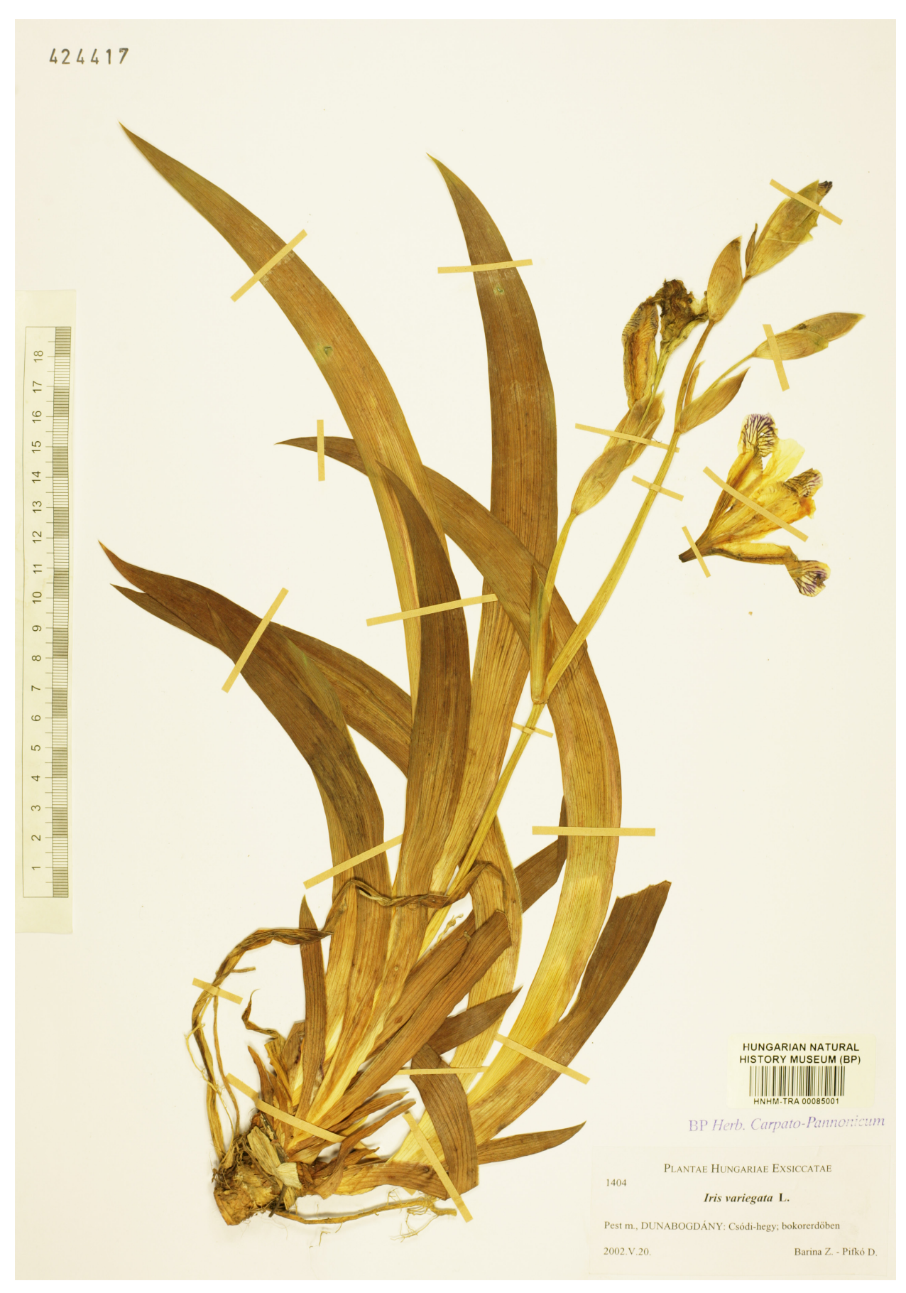
Fig. 2. Neotype of Iris variegata : the specimen BP HNHM-TRA 00085001.