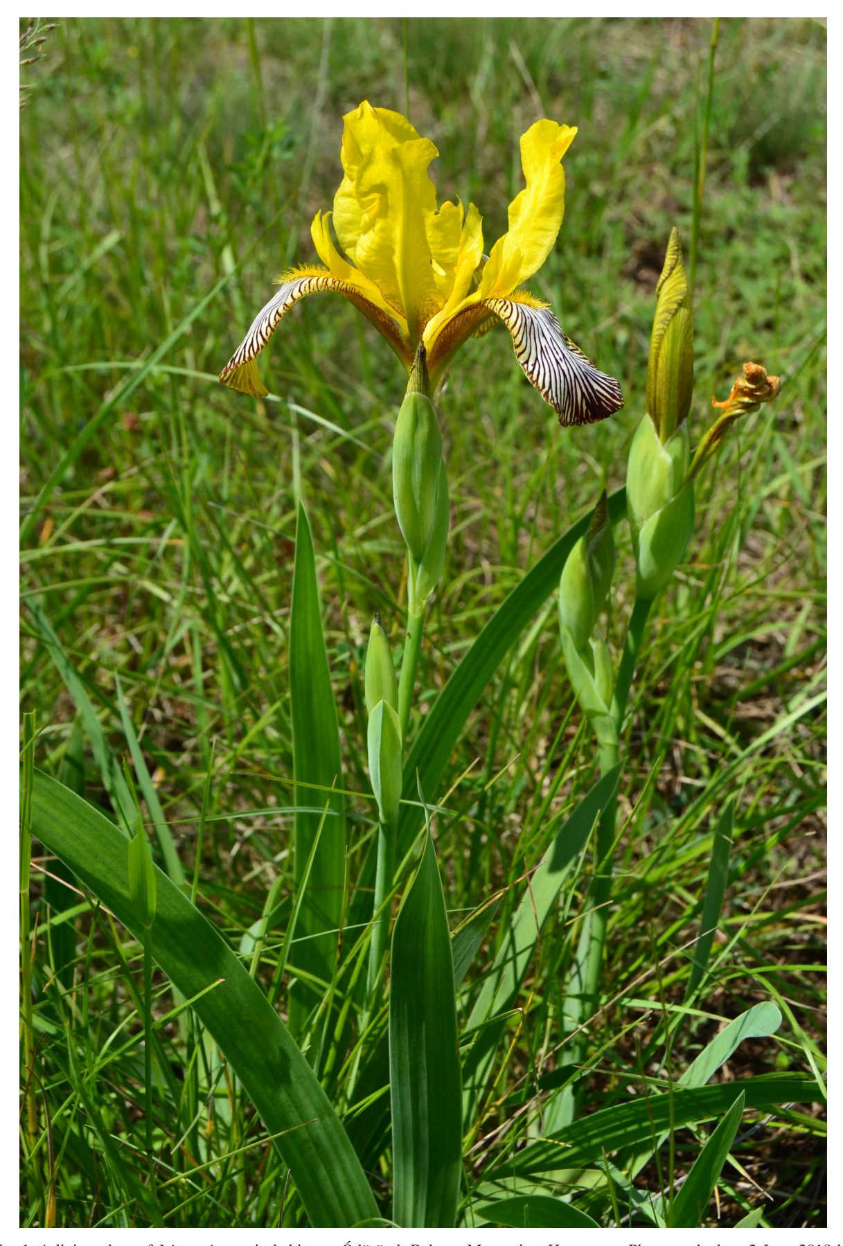
Fig. 1. A living plant of Iris variegata in habitat at Ódörögd, Bakony Mountains, Hungary.