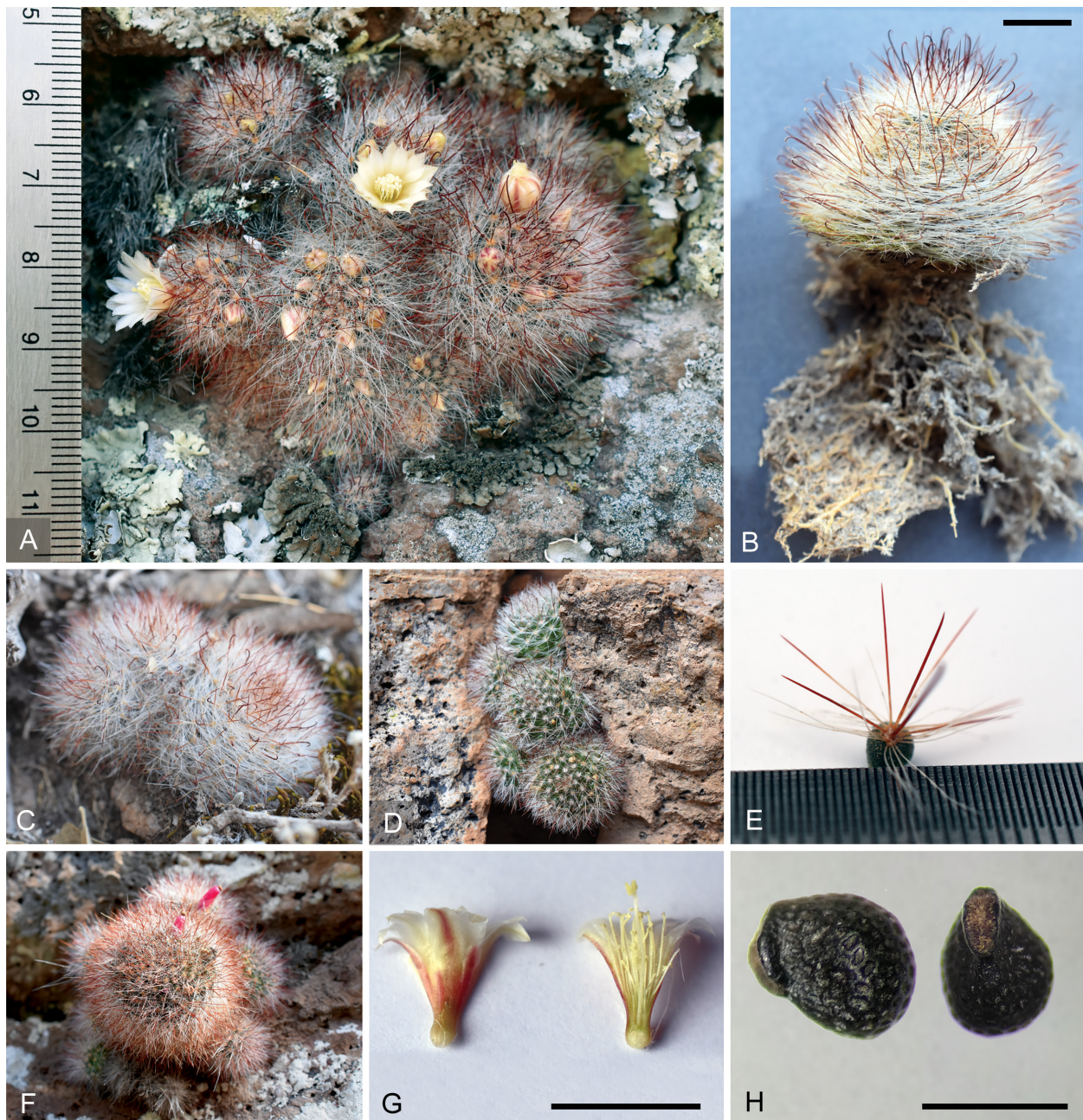
Fig. 3. Morphology of Mammillaria morentiniana during dry and rainy seasons. – A: plant flowering in habitat; B: stem and roots; C: stems during dry season covered by radial spines resembling white needle-bristles; D: stems during rainy season showing hydrated and expanded tubercles; E: close-up of tubercle and areole bearing six central spines; F: plant bearing red and claviform fruits; G: flower in longitudinal section, outside and inside views; H: seeds. – Scale bars: A = primary graduations of 1 cm, secondary graduations of 1 mm; B = 10 mm; E = graduations of 0.5 mm; G = 10 mm; H = 1 mm.

0.7(–9.2) mm long, glabrous. Flowers infundibuliform, 7–9 mm long; outer tepals pale yellow with reddish middle stripe, lanceolate, margin entire; inner tepals pale yellow, lanceolate, margin entire; filaments pale yellow; anthers yellow; style pale yellow; stigma pale yellow, 4-lobed. Fruit pink, claviform, 10–20 mm long; seeds black, c. 1.1 mm in diam.; aril absent; testa pitted.