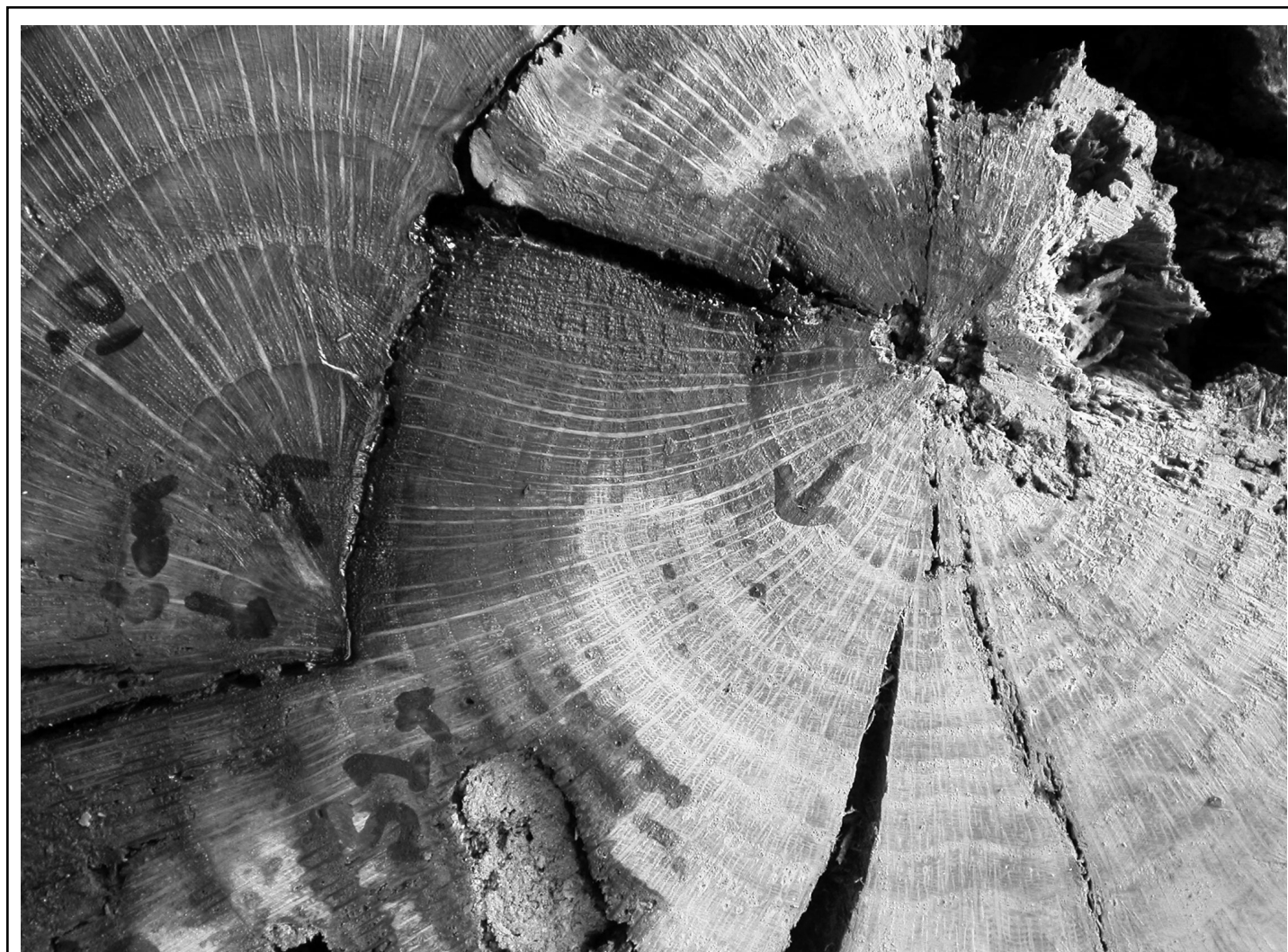
Figure 2. Example of fire scarring within a black oak cross-section (S7 in Figure 1), collected in 2009, High Park, Toronto. Subsequent ring growth exhibited sealing over the scar and an episode of increased ring width.

individuals in a burn. We therefore used the following corroborative fire event indicators: (1) the timing of establishment of multistemmed individuals (three of the 14 cross-sectioned individuals), which, among oaks, indicates basal resprouting in response to having been top-killed as a sapling, typically by fire or other disturbance (Keeley 1992; Del Tredici 2001), and (2) the presence of even-age cohorts in the pre-settlement period, which is suggestive of a fire-induced recruitment period (Abrams 1992; Peterson and Reich 2001). Our sample of cross-sections was also used to determine establishment dates ( n = 14 ). With respect to multistemmed individuals, resprouting following fire disturbance occurs simultaneously across all