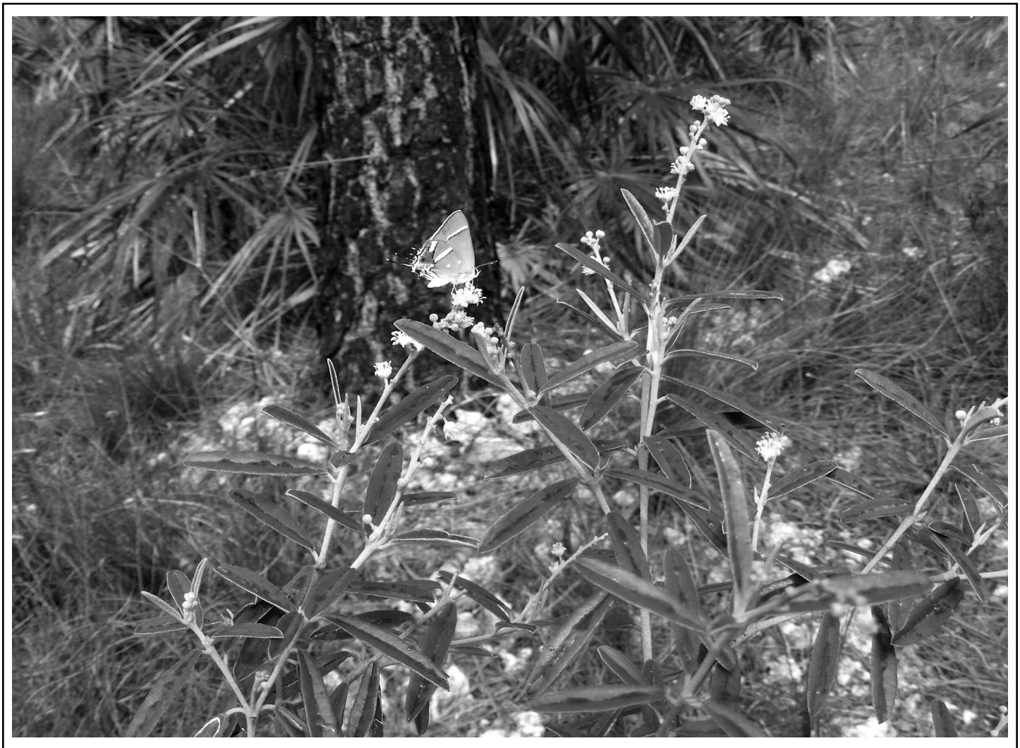
Figure 1. Croton linearis in Miami-Dade County's Larry and Penny Thompson Park. This male plant is being visited by the federally endangered butterfly, Bartram's scrub-hairstreak.

ami, and Navy Wells is 48 km southwest of downtown Miami. Both areas have well-established populations of Bartram's scrub-hairstreak (USFWS 2014). The Florida leafwing was once established in both regions, but has not been documented as maintaining a population at either location in the past 25 years (USFWS 2014). For each of the two core areas, we selected preserves to survey if they contained pine rockland and were within four km of the core. We further narrowed our criteria to include only preserves owned and managed by Miami-Dade County, thus excluding approximately 250 ha of pine rockland in the Richmond area that are in federal or private ownership. With these restrictions in mind, we selected ten preserves total-