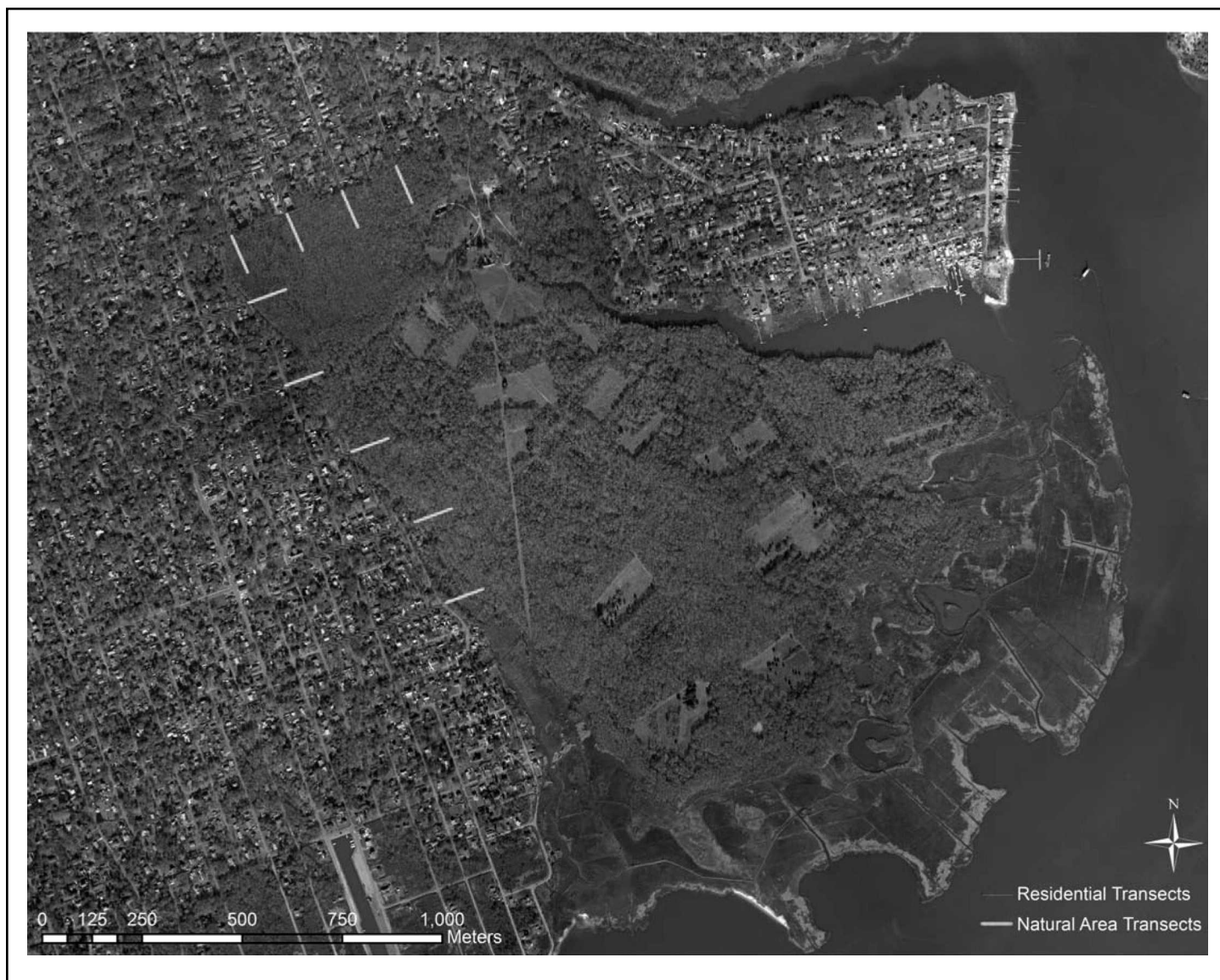
Figure 1. Location of natural area surveys within and residential area surveys surrounding the William Floyd Estate (WFE), Mastic Beach, New York.

across the region (LIISMA 2016). In 2008, LIISMA designed a protocol for assessing the invasiveness of nonnative plant species found in the region (LIISMA 2016). The protocol ranks nonnative plant species invasive threat levels from Low to Very High. These rankings are based on several criteria, including ecological impact, biological characteristics, dispersal ability, ecological amplitude, distribution, difficulty to control, and status of cultivars/hybrids.