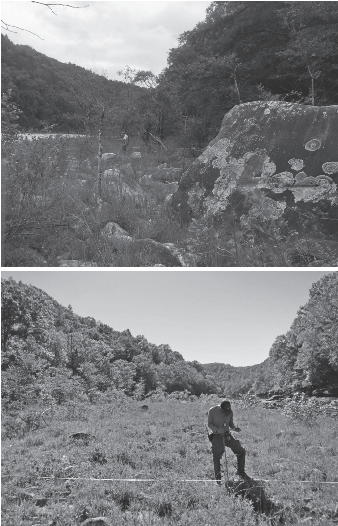
Figure 2. —Riverscour monitoring in an Appalachian Acidic Sandstone Rivershore Prairie at Gauley River National Recreation Area (top) and in a Cumberland Riverside Scour Prairie at Big South Fork National River & Recreation Area (bottom).

not only the timing and volume of water, but also the water temperature and the transport of sediment (Parasiewicz 2001; Bennett and McDonald 2006). Climate change can also alter river flow regimes, changing the frequency or intensity of scour events, especially in times of unprecedented storms and droughts. Warmer winter temperatures will reduce winter ice accumulation and spring ice scour that are critical to maintaining riverscour communities in the northeastern United States (Rustad et al. 2012). In addition, multiple anthropogenic stressors impact rivers in the eastern United States such as point and non-point source pollution; acid rain; floodplain and channel alterations from roads, railroads, and bridges; heavily concentrated recreation; municipal water withdrawal and wastewater discharge; and nonnative invasive plants (Podniewski et al. 2010).