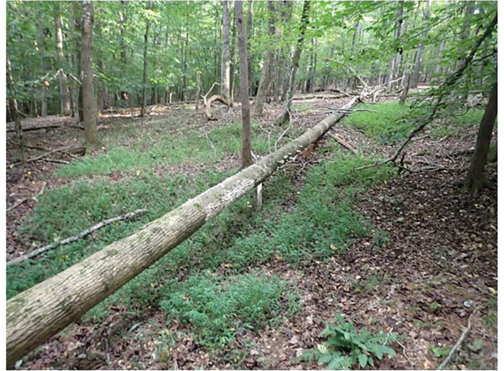
Figure 3. —Japanese stilt grass ( Microstegium vimineum (Trin.) A. Camus.) invasion within the University of Georgia Forest Dynamics Plot (UGA FDP) at the State Botanical Garden of Georgia south of Athens, Georgia, USA (33.9015N, 83.3789W).

prediction of the mesophication hypothesis, that pyrophytic overstory species are being replaced by midstory mesophytic species due to fire suppression. Further research is needed to quantify the abiotic changes associated with mesophication, such as increased soil moisture, decreased temperature, and decreased flammability, to test other predictions of the mesophication hypothesis. Lastly, this research relies heavily on the assumption that stems in smaller size classes are representative of the future overstory, which is commonplace in forestry thinking. Although we believe this is a reasonable assumption, long-term forest dynamics studies are needed to confirm this assumption.