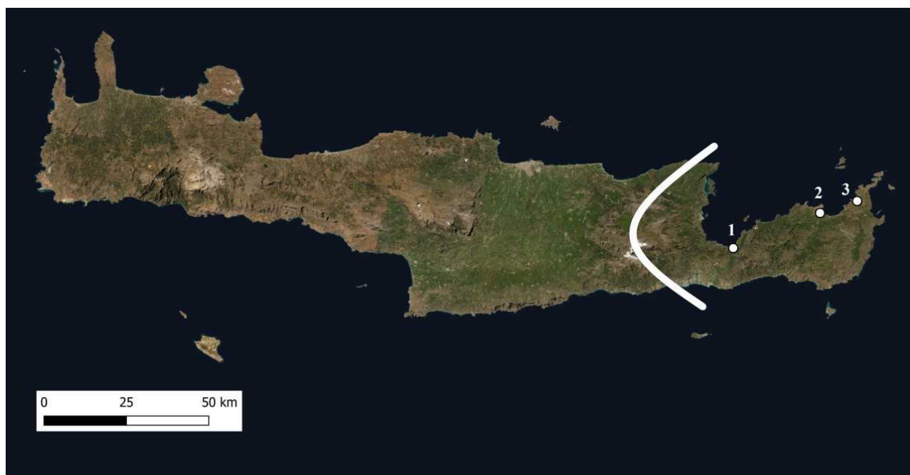
Fig. 3. Anarthrotarsus trichasi sp. nov.; localities on the island of Crete: 1 - Pacheia Ammos; 2 - Siteia Bay; 3 - Moni Toplou. White line indicates eastern border of the Dikti Mountain Range.

Body, ventral side: Increased papillation and the same proportion as on the dorsal side.