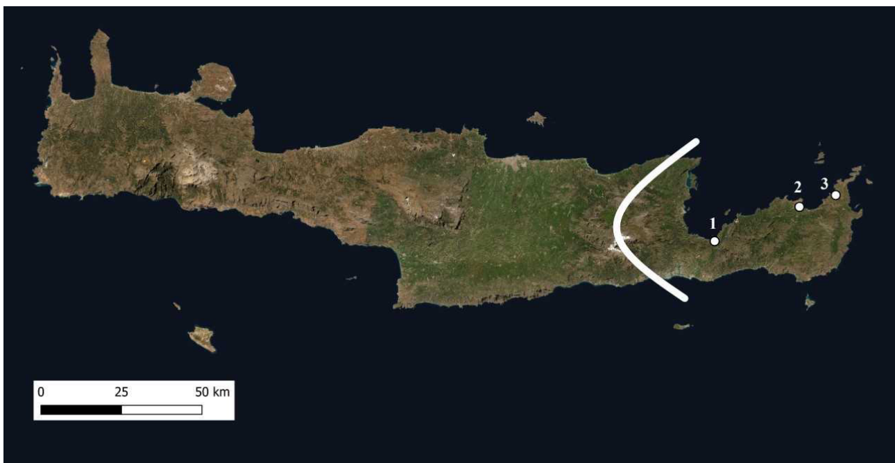
Fig. 3. Anarthrotarsus trichasi sp. nov.; localities on the island of Crete: 1 - Pacheia Ammos; 2 - Siteia Bay; 3 - Moni Toplou. White line indicates eastern border of the Dikti Mountain Range.

Body, ventral side: Increased papillation and the same proportion as on the dorsal side.