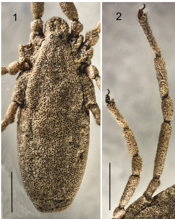
Figs 1-2. Anarthrotarsus trichasi sp. nov. (1) Body in dorsal view. (2) Legs III and IV in prolateral view. Scales: 1.0 mm.

1 specimen of Calathocratus sp.; IRAN, Masanderan; 31.5.1978; leg. J. Martens. – CJM 2464; 1 specimen of Calathocratus sp.; ISRAEL, Hazafon, Lower Galilee; 9.2.1987; leg. W. Schawaller & H. Schmalfuß. – CJM 6586; 3 specimens of Calathocratus sp.; TAJIKISTAN, Sary-Khosor State Reserve; 28.4.1990; leg. S. Dashdamirov.