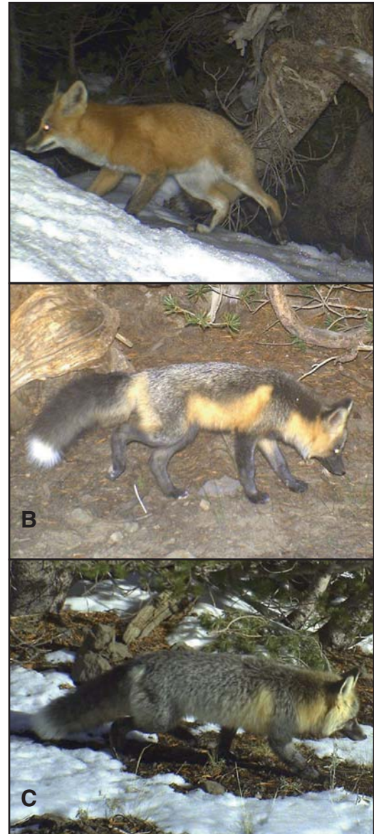
Figure 2. Red fox photographs taken near the Sonora Pass using remote digital camera stations: A) red-pelage individual photographed at 2326 hrs on 8 October 2010, B) cross-pelage individual photographed at 0105 hrs on 7 September 2010, and C) cross-pelage individual photographed at 1315 hrs on 31 October 2010.

the Sierra Nevada red fox (Table 3). Haplotype J-34, which is one cytochrome b base-substitution from C-34, was found in 3 museum samples from the Sierra Nevada. A single museum specimen