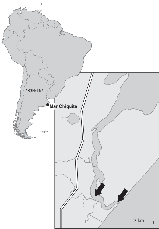
Figure 1. Location of Mar Chiquita Coastal Lagoon (37°40'S, 57°22'W), Buenos Aires Province, Argentina, with a detail of the study area at Mar Chiquita Coastal Lagoon. Arrows indicate main concentrations of Black Skimmers.

a tube containing 1.5 ml absolute ethanol and stored at room temperature until analysis.