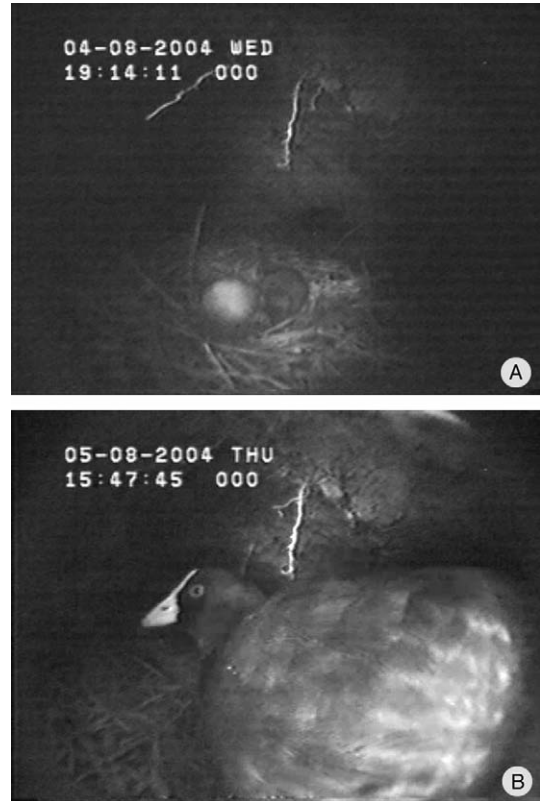
Figure 2. Still images captured from video showing (A) a House Mouse attempting to eat an unattended Atlantic Petrel egg, and (B) a Gough Moorhen inside the same burrow, a few hours later (note date and time data on top left hand corner of images) eating the egg.

Mice pose a significant threat to Gough Island's biodiversity (Jones et al. 2003, Wanless et al. 2007). Plans to eradicate the mice, using poisons proven to be effective against mice but which are also toxic to birds, are well advanced (Brown