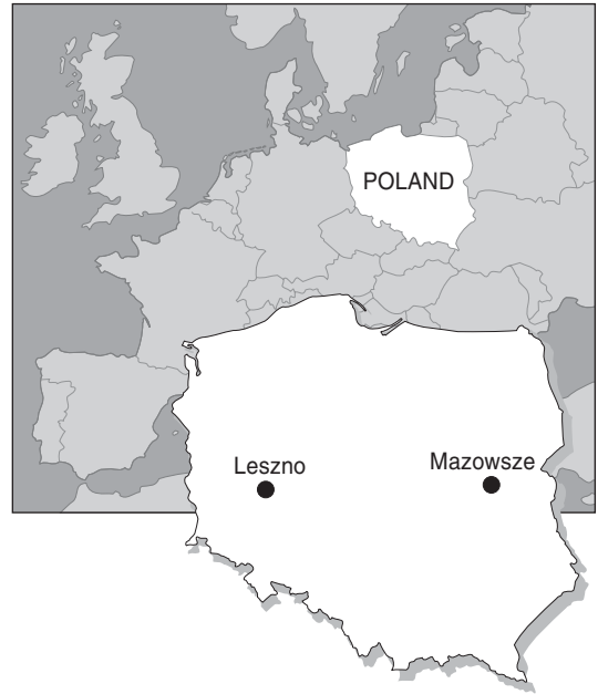
Figure 1. Location of the two main study plots in Poland.

Fieldwork was conducted in the breeding seasons 1996–2005 near Leszno in western Poland (Fig. 1), which has typical breeding densities of the Red-backed Shrike in Poland: c. 4.7 breeding pairs/km 2 (Kuźniak & Tryjanowski 2000, and unpublished data). In total the study area covered c. 20 km 2 . Between 1998 and 2003 another study plot (9 km 2 ) was established in farmland at Mazowsze in the Mazovian Lowland (central eastern Poland). With a density up to 19 breeding pairs/km 2 the Red-backed Shrike was among the most numerous species at this location (more details in Gołowski 2006). Detected nests were checked regularly but due to the adverse human impact of disturbance on nest success (Tryjanowski & Kuźniak 1999) only 1–5 visits (depending on nest searching time) were done, every 4–5 days. At the appropriate age nestlings were ringed. A total of 122 adults and 1245 nestlings (122 adults and 861 nestlings in Leszno, 384 nestlings in Mazowsze) were ringed between 1996 and 2005. The number of investigated breeding pairs per season varied between 42 and 96. Adult birds were trapped and re-trapped by means of mist-nets and bowl-traps with a cricket inserted as a lure. Adults and nestlings were provided with numbered aluminium rings (Ringing Centre, Department of Ornithology PAS, Poland, ring series J) and some were also ringed by a combination of colour rings (33 males and 31 females in 1997–1999). This enabled easy identification of individuals by visual observation. If we