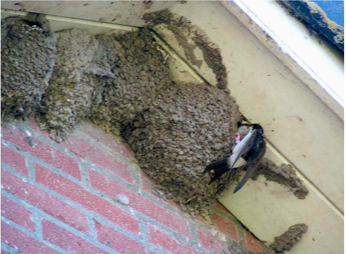
Figure 1. Female IPiPi feeding a large nestling at North 8 in the afternoon of 1 September 2007, the nest where she also raised her first brood. See www.ardeajournal.nl for a full-colour version of this picture.

If we accept that female IPiPi was indeed provisioning two second broods in late August and early September, what made a member of a species where social monogamy is the rule, and only polygamy by males is regarded as a possibility (Turner 2004), engage in such apparent polyandry? Apparent, as we have no proof that IPiPi was actually the mother of the chicks in either North 8 or East 4, or involved in the incubation of the latter clutch. What we know is that perhaps IGnY had lost its partner by the time he was captured on 5 July, that there were fights near East 4 on 18 July, that an unringed adult entered it on 22 July, and that no unringed adult was provisioning the nestlings in East 4 during the intense observations in late August or on 1 September (although