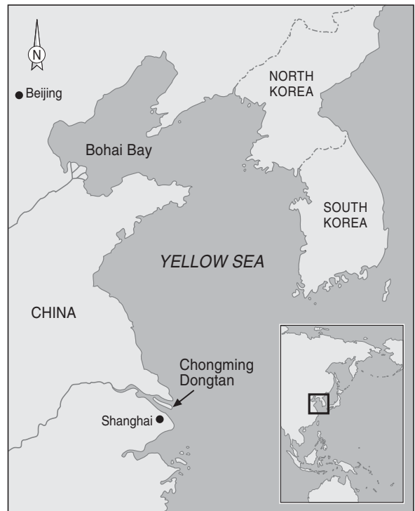
Figure 1. Map of Chongming Dongtan in the Yellow Sea region. The inset shows the location of Yellow Sea region within the East Asian–Australasian Flyway.

Supporting five million migratory shorebirds, the East Asian–Australasian Flyway is a major component of the Global Flyway (Barter 2002, Piersma 2007). Previous research along the East Asian–Australasian Flyway has yielded important insights into the variation in migration strategies of different shorebirds (Battley et al. 2000, 2005, Driscoll & Mutsuyuki 2002, Gill et al. 2005). Based on satellite tracking, recovery records and flight range estimates, these studies have shown that shorebirds are capable of a nonstop trans-oceanic flight between Australia and East China. Moreover, Tulp et al. (1994) suggested that large calidrid sandpipers such as Great Knot and Red Knot, fly directly from northwest Australia to the east China coast, while small species such as Red-necked Stint Calidris ruficollis are bound to stage and refuel in southeast Asia before continuing their northward migration. Their hypotheses are supported by the observation of Red-necked Stints in large flocks in southeast Asia