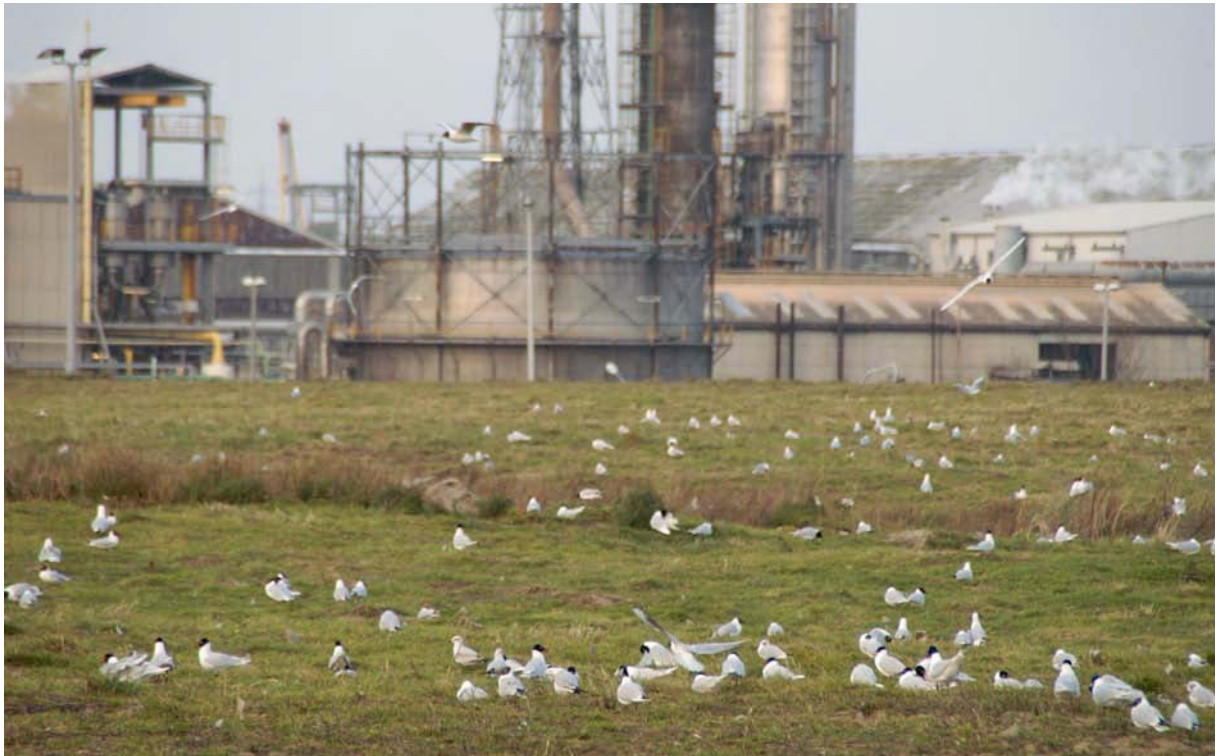
Figure 1. View on a mixed breeding colony of Mediterranean Gull and Black-headed Gull, Zandvlietsluis, Antwerpen, Belgium.

and/or newly-established populations (Courchamp et al. 1999, Stephens & Sutherland 1999). Unfortunately, relatively few studies have assessed whether Allee effects exist in natural populations (Courchamp et al. 1999, Serrano et al. 2005). This situation is not surprising, because Allee effects are easily missed either simply due to lack of data (large data sets are needed to reliably estimate fitness parameters at low densities) or lack of appropriate data (data on the lowest densities are often not available) (Courchamp et al. 1999).