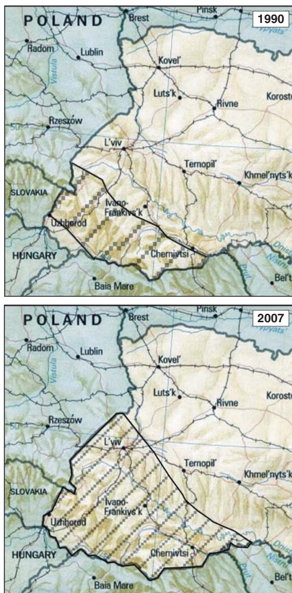
Figure 2. Distribution of the Ural Owl in western Ukraine, as of 1990 and 2007.

In Ukraine, Ural Owls occurred only in the Carpathians area until the last decade. The subspecies S. u. macroura has increased its range southwards and westwards in Slovakia and Hungary (Mebs & Scherzinger 2000, Danko et al. 2002, Adamec et al. 2003, Kristin et al. 2007). The placement of nest boxes has influenced the process of range expansion in eastern Slovakia (Danko et al. 2002). Reintroduction programs at German and Czech sites have been able to re-establish apparently stable populations in the Moravian-Silesian Beskids (Schäffer 1993, Scherzinger 1996, Bufka & Kloubec 1999, Vermouzek et al. 2004).