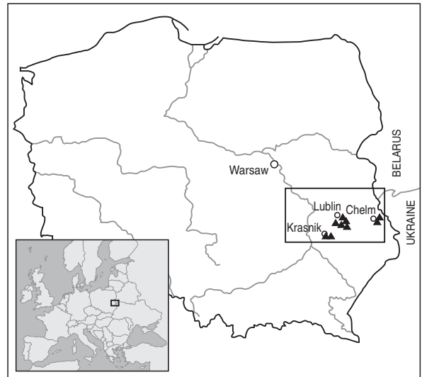
Figure 1. Location of Little Owl study sites in the Lublin Region, eastern Poland.

Locations of radio-marked owls were made between 27 April and 3 August, i.e. from egg laying until the young dispersed, during 2000 to 2003. Observers tracked owls on foot, and observation periods on each owl typically started before nightfall at 19:00–20:00 and lasted until 4:00–5:00. Owl locations were plotted on 1:10 000 scale maps using the triangulation