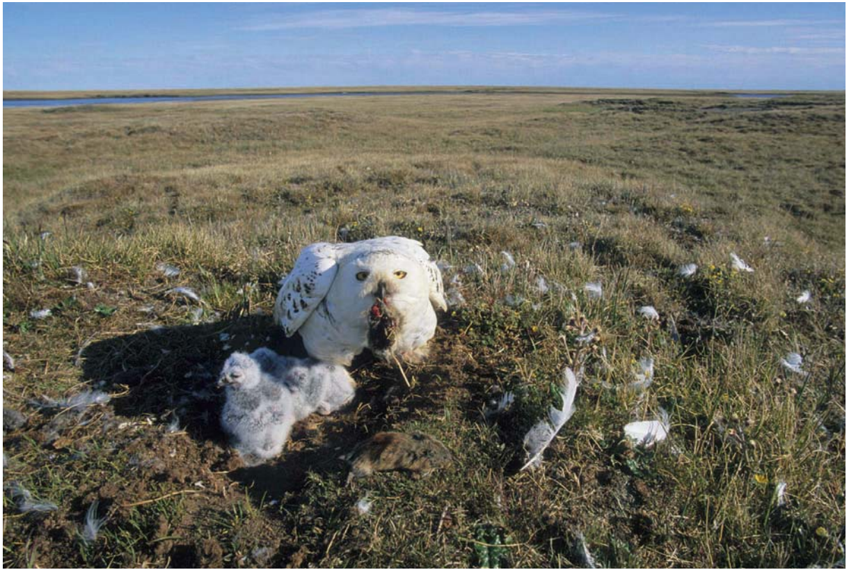
Figure 1. Snowy Owl feeding young at nest, showing use of polygon/mound landscape, Barrow, Alaska.