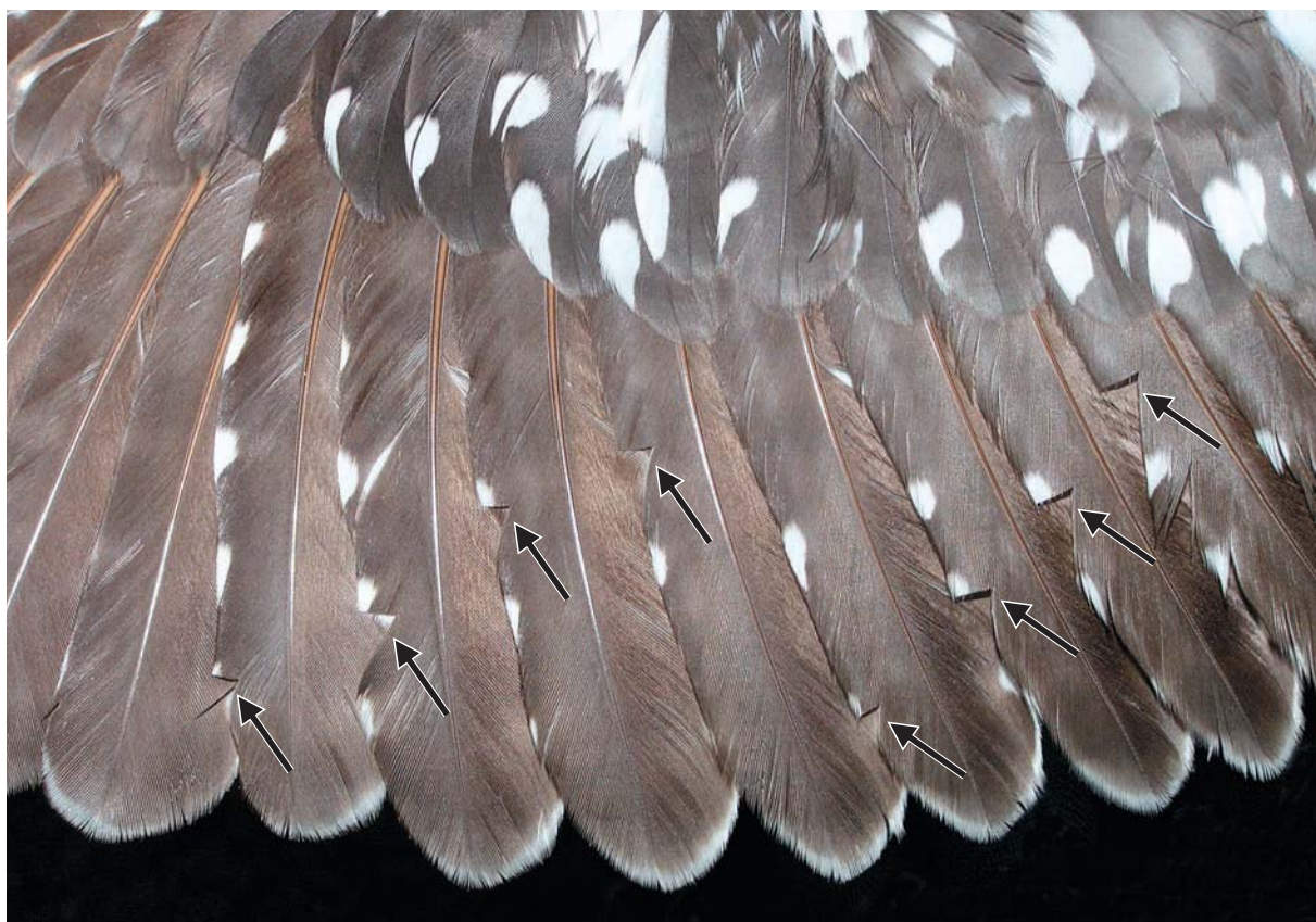
Figure 1. Photograph of open Northern Hawk Owl wing showing method of marking (indicated by the arrows) the position of secondaries in the wing during autumn moult verification.

Intensity of shedding index (ISI) describes how often and how long feathers are shed in a given period or over the whole moulting season. It is the ratio of total length of shed feathers to number of days and is expressed in mm/d. The length of shed feathers were derived from an owl feather database where average length of primaries, secondaries and rectrices was calculated on the basis of 24 feather sets (MC, unpubl. data). This index was used to investigate the effect of ambient temperature on feather shedding patterns.