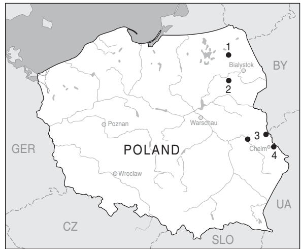
Figure 1. Geographical position of the Polish wetland areas mentioned: (1) Biebrza Valley, (2) Narew National Park, (3) Łęczna–Włodawa Lake District, (4) carbonate fen mires near Chelme.

The Łęczna–Włodawa Lake District is another important Polish wetland (c. 154 km 2 ) situated north-east of Lublin (Fig. 1). Its most natural part is protected since